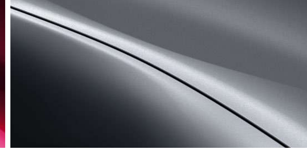
Machine Grey Metallic ▲■^