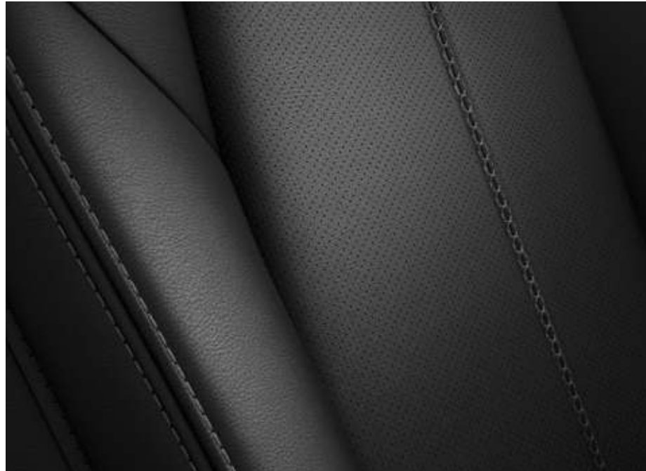
Black leather# (Roadster GT, Roadster GT RS, RF GT and RF GT RS)