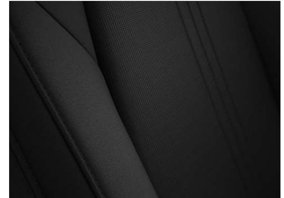
Black cloth (Roadster)