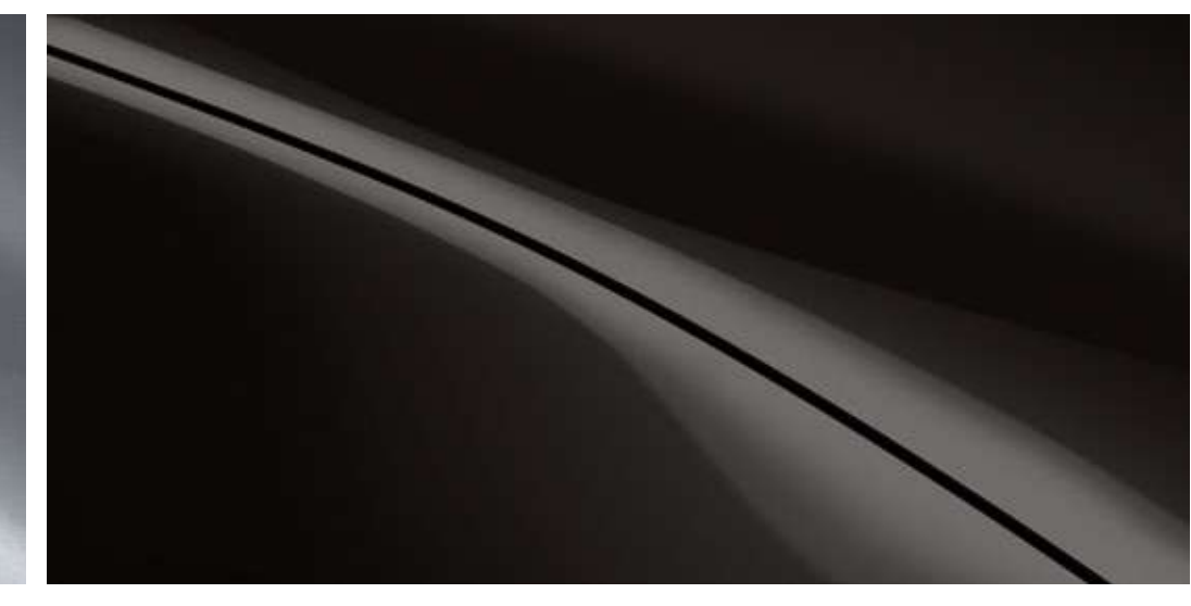
Jet Black Mica