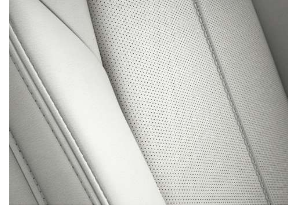
Pure White nappa leather ▲* (RF GT)