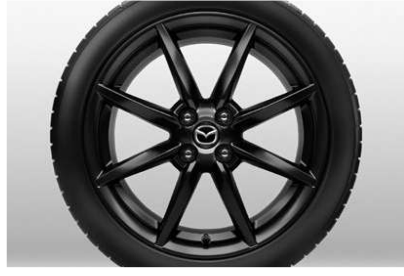
17-inch black metallic alloy wheel (RF)