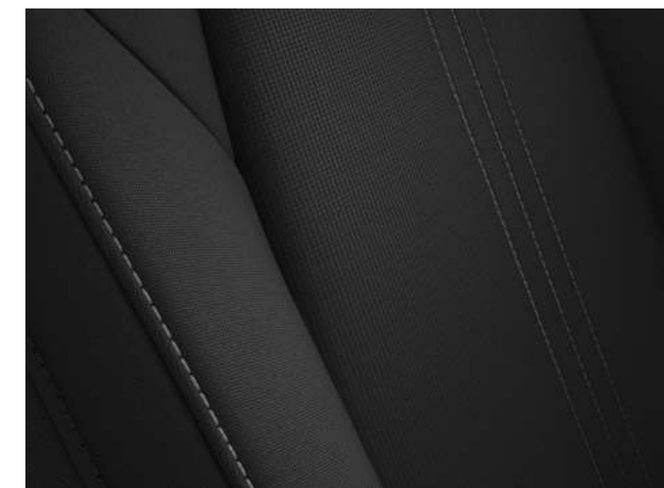
Black cloth (RF)