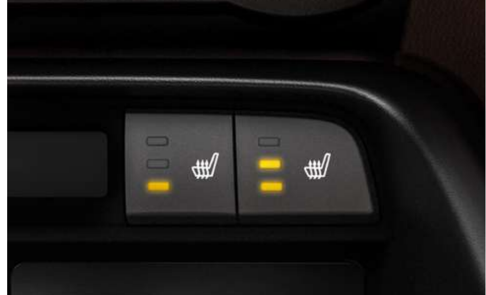
THE HOT SEAT

Jointly developed with Bose,® the premium 9 speaker audio system produces stunning quality even with the top down.