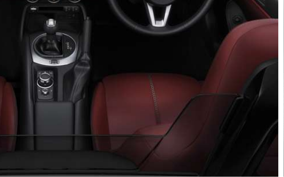
BURGUNDY NAPPA LEATHER

Lane Departure Warning (LDW) alerts you if you accidently stray from your lane.†