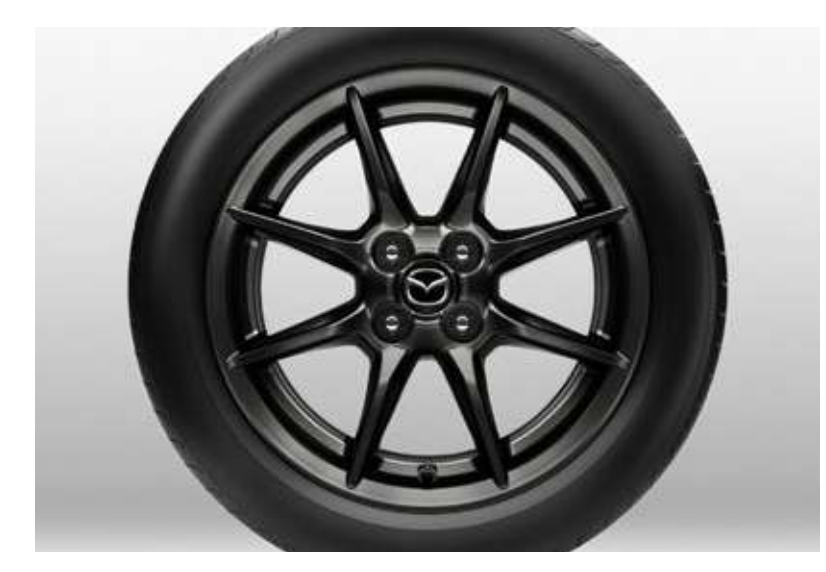
16-inch black metallic alloy wheel (Roadster)