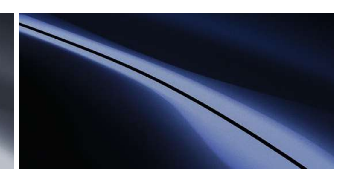
Deep Crystal Blue Mica 💵