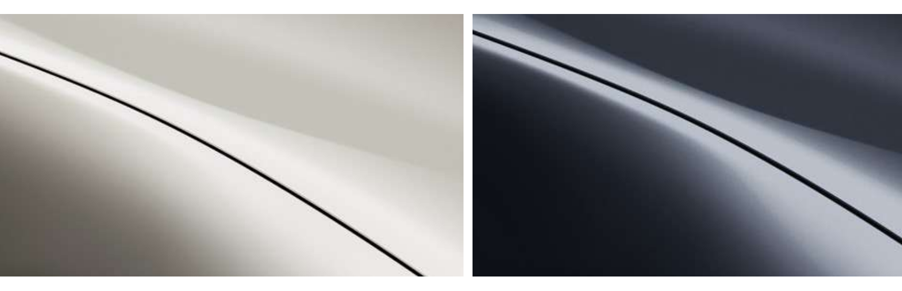
Polymetal Grey Metallic ▲■^