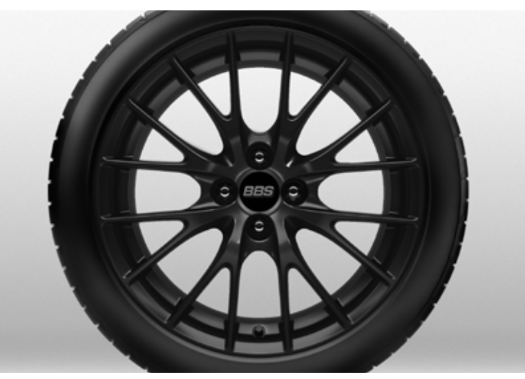
(Roadster GT RS and RF GT RS)