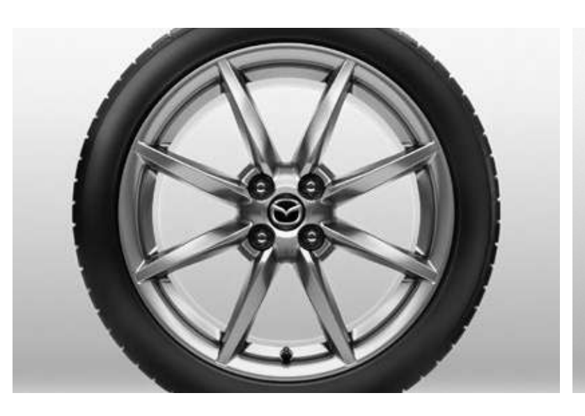
17-inch bright silver alloy wheel 17-inch BBS forged alloy wheel (Roadster GT and RF GT)