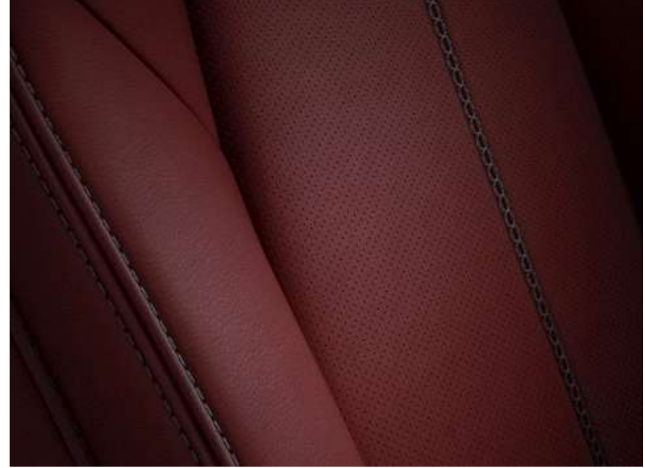
Burgundy nappa leather ■* (RF GT)