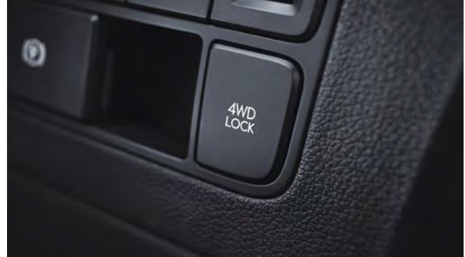
HTRAC all-wheel drive1