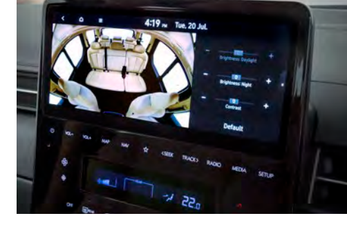
Rear Passenger View Monitor <sup>2</sup>