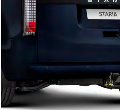
2.5 tonne towing capacity (braked)<sup>2</sup>