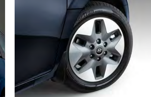
Top: LED Daytime Running Light bar (DRL) Bottom: 18" alloy wheels