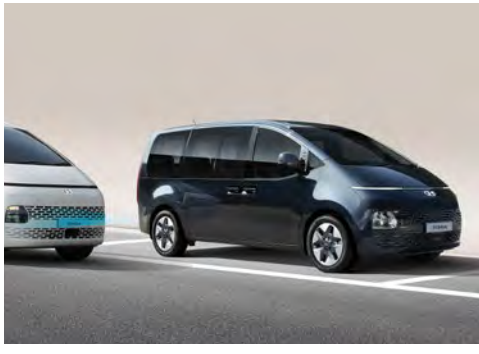
Safe Exit Assist (SEA)<sup>3</sup>