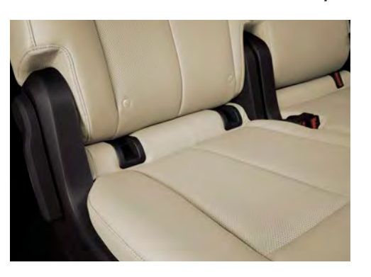
2 ISOFIX child restraint anchors - 2nd row