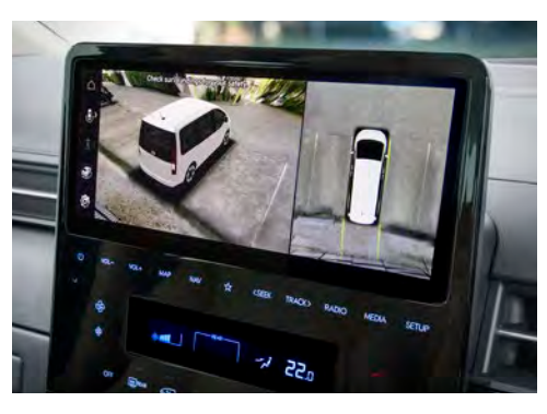
Surround View Monitor with 360° functionality 3