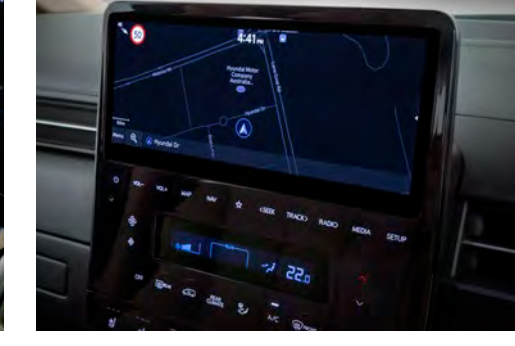
Top: 10.25" digital supervision cluster<sup>6</sup> Bottom: Satellite navigation<sup>5</sup>