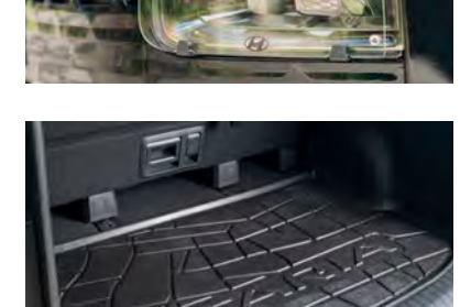
Top: Healight Protector Bottom: Cargo Tray Liner