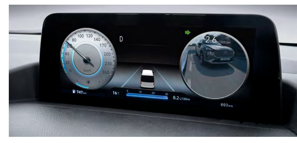
Blind-Spot View Monitor (BVM) <sup>2</sup>