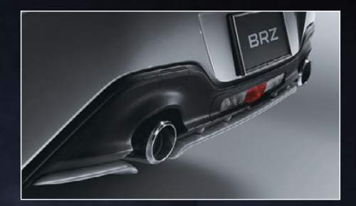
REAR UNDER DIFFUSER (SILVER)