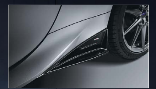
STI SIDE UNDER SPOILER