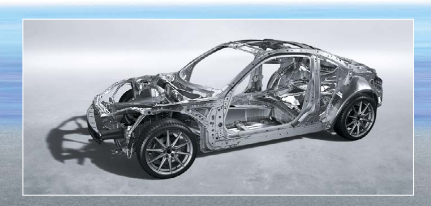
The passenger safety cell absorb and direct impact force around the cabin, rather than through it.

It has always been Subaru's purpose to design vehicles with a crucial advantage in road safety and occupant protection. While Towards Zero fatal road accidents in a Subaru vehicle by the year 2030<sup>1</sup> represents Subaru's ambitious future target, decades of astute observation, structural development and design research has informed the remarkable safety advances built into Subaru BRZ.