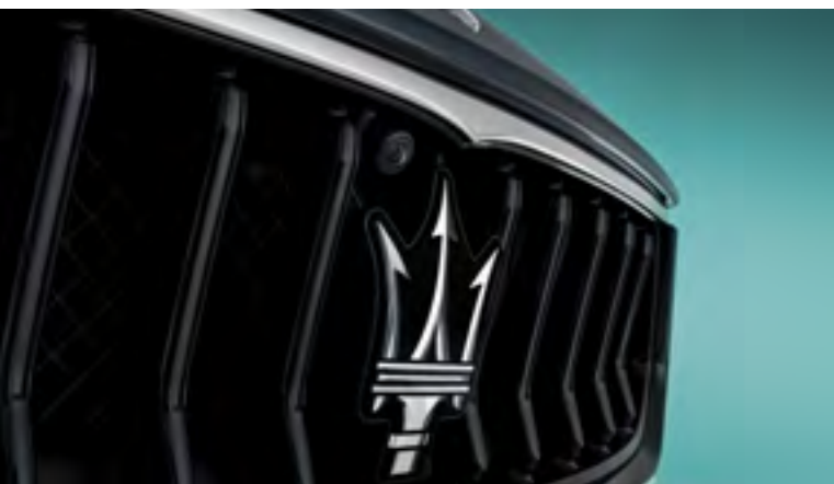
Ghibli - Grille