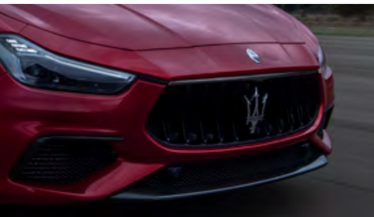
Ghibli Trofeo - Grille