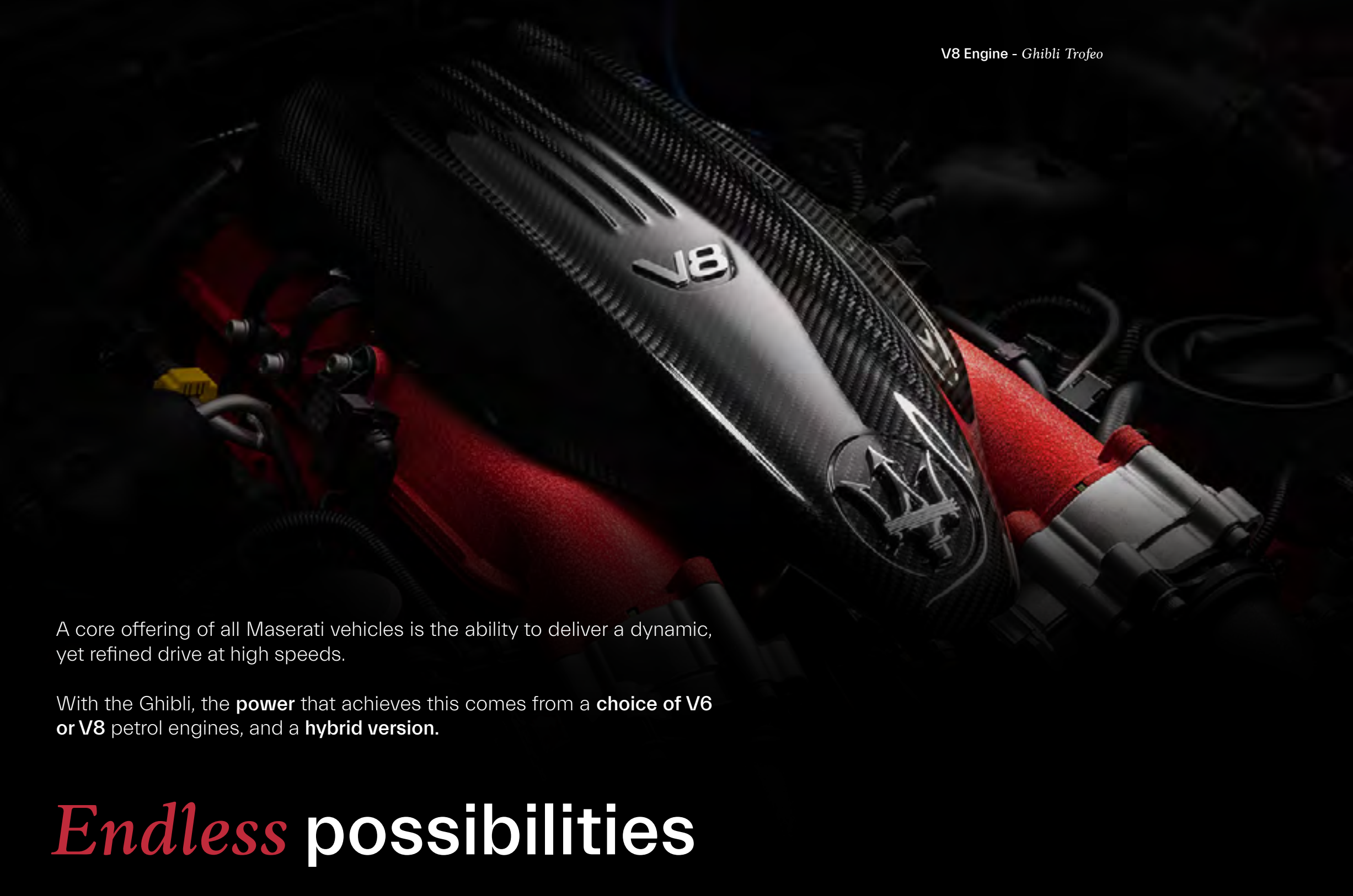
V8 Engine - Ghibli Trofeo