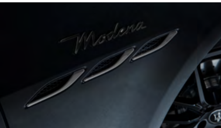
Ghibli - Side air vents and Modena Badge