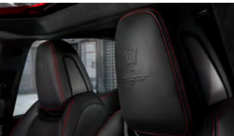
Ghibli Trofeo - Headrest detail