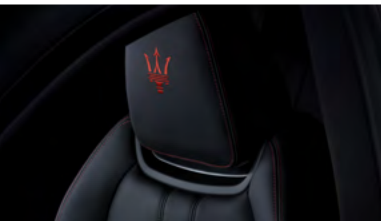
Ghibli - Headrest detail