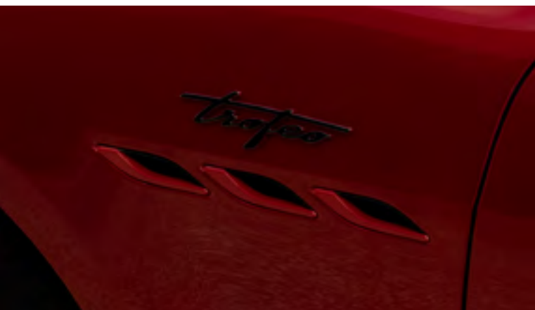
Ghibli Trofeo - Side air vents and Trofeo Badge