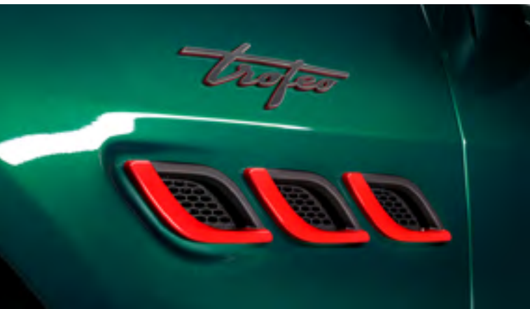
Quattroporte Trofeo - Side air vents and Trofeo Badge