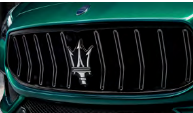
Quattroporte Trofeo - Grille

The fastest, the finest. The powerful icon that is the Quattroporte takes luxury grand touring to unprecedented levels of performance. For those who belong in the fast lane of exclusivity.