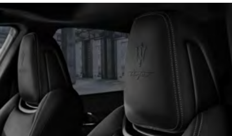
Quattroporte Trofeo - Headrest detail