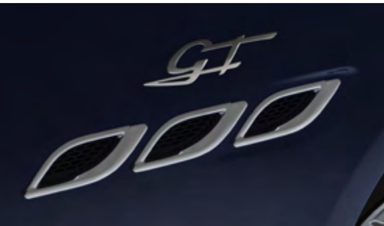
Quattroporte - Side air vents and GT Badge

The Quattroporte offers a combination of inspirational, high-capacity power and high-end business-like intelligence. So while it performs like a track-ready supercar, it's also remarkably efficient. Luxury, scale and space meet phenomenal dynamic capabilities in the Maserati Quattroporte – and it's all perfectly expressed by its stately yet dynamically intense exterior. With a perfectly balanced weight distribution, standard Skyhook suspensions, Brembo dual-cast brakes, the Quattroporte blend phenomenal dynamics with absolute comfort and safety.