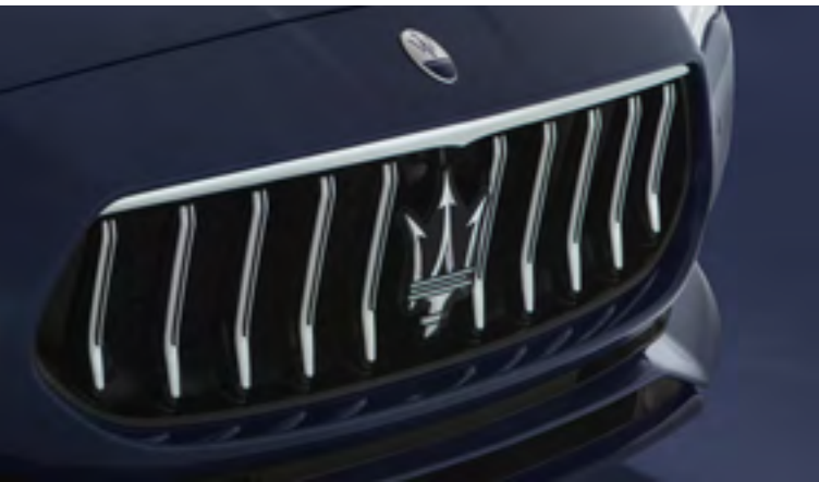
Quattroporte - Grille