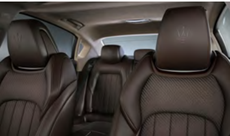
Quattroporte - Headrest detail