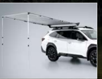
LIFESTYLE AWNING KIT<sup>1</sup> – OPEN