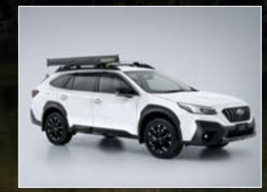
LIFESTYLE AWNING KIT<sup>1</sup> – CLOSED

So whether you want to protect your investment, or be inspired to go further, check out the full range – including popular accessory bundle packs offering great value at www.subaru.com.au/outback/accessories