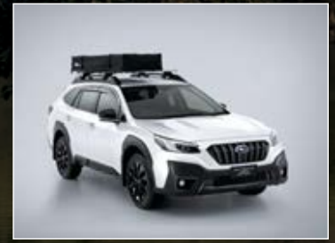
THULE ROOF TOP TENT<sup>2</sup> – CLOSED