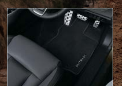
CARPET MAT SET