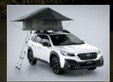
THULE ROOF TOP TENT<sup>2</sup> – OPEN

Maximise your next outdoor adventure with Subaru's full range of customised lifestyle accessories. Fit out your Subaru Outback with a multi accessory pack or choose individual items, like the durable Lifestyle Awning Kit<sup>1</sup> or Roof Top Tent<sup>2</sup> for easy, go anywhere camping. Or use the impressive towing capability to take your latest toy, with accessories to complement your favourite activities. For the full list of accessories available see the following pages.