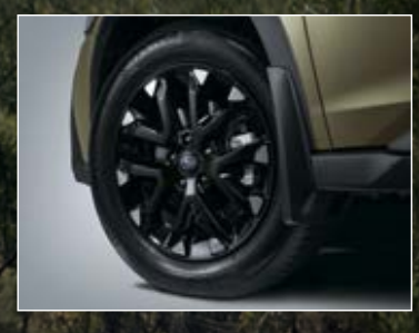
18" RUGGED WHEEL SET