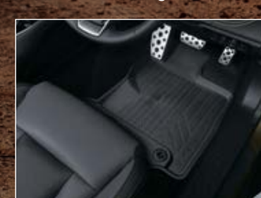
RUBBER MAT SET