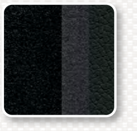
Black Ultrasuede® (BGU)