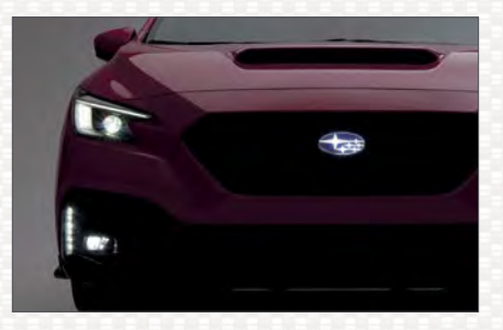
enhancement to the front grille of your WRX. This decorative accessory accentuates the Subaru emblem by adding a touch of soft white LED lighting. Illumination is activated when the vehicle is started and remains on while the vehicle is running.