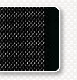
Black Cloth (BC)