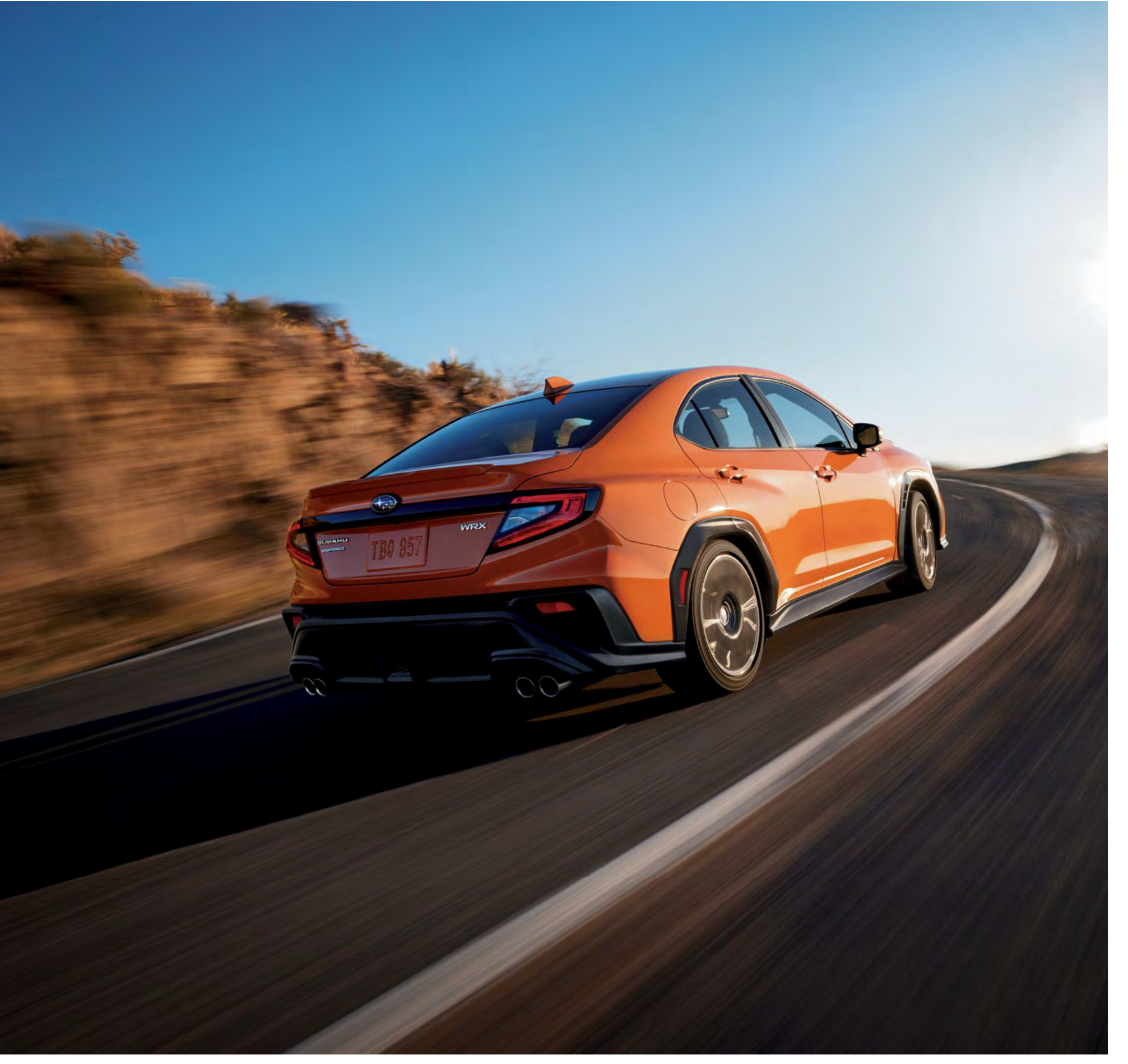
WRX Limited in Solar Orange Pearl.