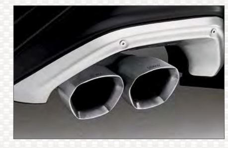
Exhaust Finisher. Precision-formed stainless steel trim pieces add a serious performance look to the rear of the WRX.