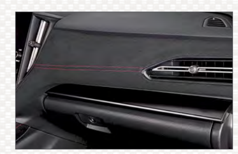
Ultrasuede® Instrument Panels. Stylish and durable Ultrasuede® Instrument Panels add a rich, textured appearance to the front dash. The panels are engineered for a precise fit around the dash vents and are finished with red stitching to complement the interior of your WRX.