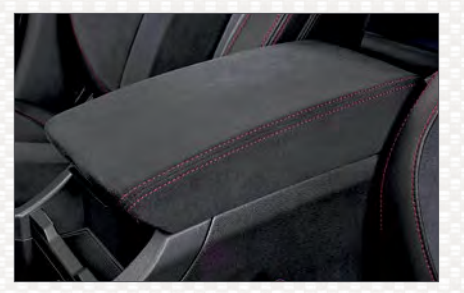
Ultrasuede® Center Console Lid. Adds a sporty look and a soft texture and feel to the center console. The Ultrasuede® Center Console Lid includes red stitching accents to complement the interior of your WRX.