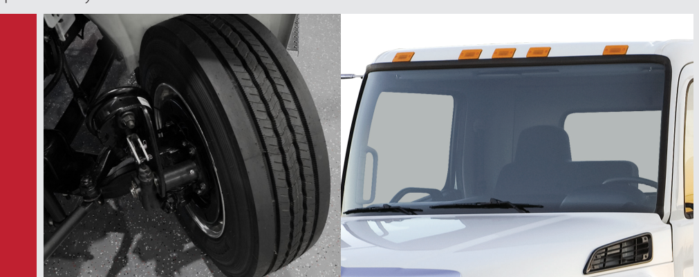
Part of what makes the L Series great for so many applications is maneuverability and visibility. 55 degree wheel cut is perfect for tight spots in the inner city and a 2,385 sq/in windshield helps drivers see through their work day.

We know driver retention is tough, this is why we offer standard equipment such as; Bluetooth Radio w/CD player, Air ride drivers seat, USB charging port, A/C, cruise control, tilt & telescopic steering wheel, will help. That's why its STANDARD.