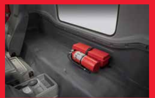
FIRE EXTINGUISHER/TRIANGLE KIT

High-visibility orange seatbelts provide quick visual verification that seat belts are being worn to conform with safety regulations. (Driver and right passenger seat only.)