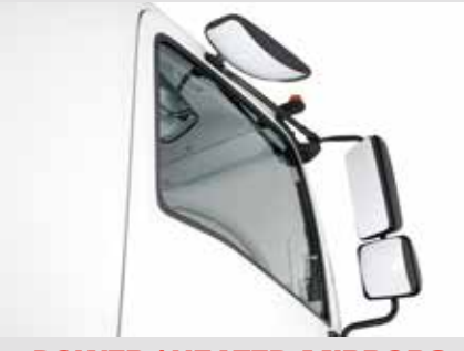
POWER / HEATED MIRRORS

Designed and tailored for a custom fit, these seat covers help reduce seat wear and tear to protect your investment while enhancing the look and feel of the cabin.