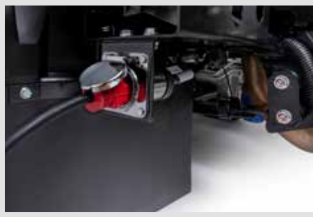
BLOCK HEATER & RECEPTACLE

Warms engine coolant for more efficient cold engine start up. Reduces the need for prolonged engine warm-up.