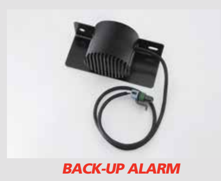
Alarm sounds when the vehicle is placed in reverse. Audible warning alerts any nearby people that the vehicle is backing up.

Conveniently locks and unlocks all cab doors at the push of a button. Two transmitters included.