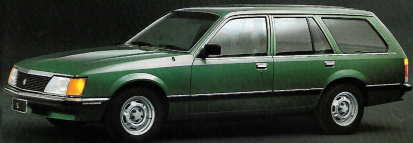
Commodore SL Wagon

Passenger side exterior rear vision mirror illustrated is optional equipment.