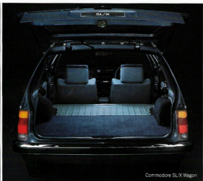
Commodore SLX Wagon

Power assisted brakes, front disc/rear drum. Steel-belted radial tyres. Steel wheels with dual safety rims. Quartz halogen headlights. 4-speed heater/ventilation with 10 outlets. Push-button AM radio. Recessed lock-down aerial. Laminated windscreen with tinted upper band. Electrically heated rear window. Infinitely reclining front bucket seats. Fold down rear seat back. Central console with parking brake handle and gear selector. Full-foam seats. Soft-grip steering wheel. Column mounted control stalk for turn signals, windscreen washers and wipers, headlight