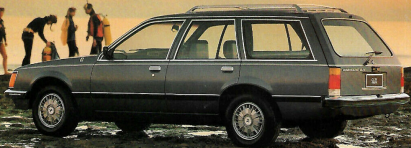
Commodore SLX Wagon