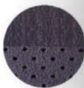
Leather/Perforated Suede Trim, Blue Graphite.