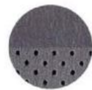
Leather/Perforated Suede Trim, Slate Grey.