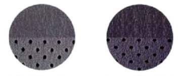
Leather/Perforated Suede Trim: Slate Grey. Leather/Perforated Suede Trim: Blue Graphite.