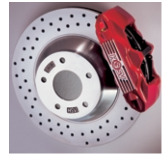
HSV Performance Brakes.

embossed logo (red) 343 x 32 mm ventilated & cross drilled disc. Rear: 315 x 18 mm