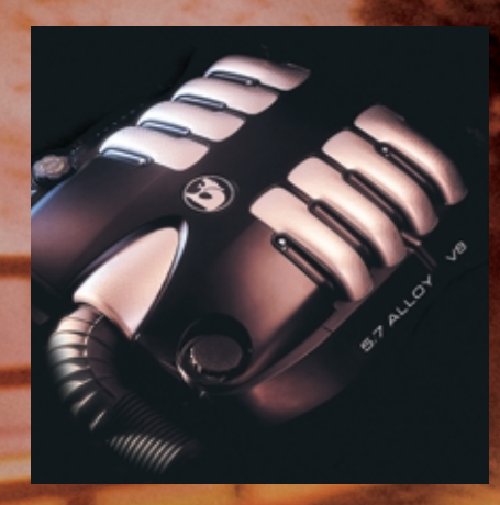
HSV's 255 LS1 needs no introduction for its ultimate performance and outstanding fuel economy at cruising speeds. Plus now it delivers extra torque at lower engine speeds.