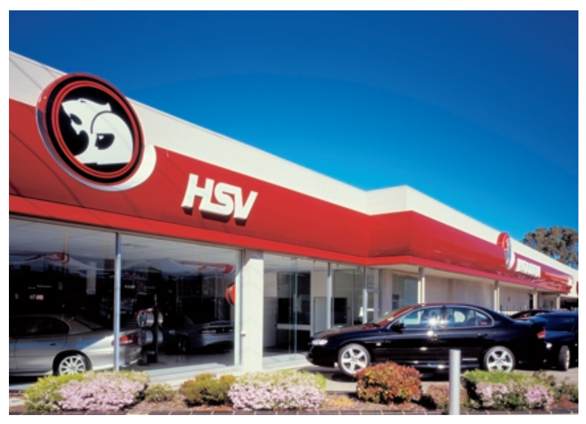
Specialist HSV Retail Sales & Service Centres in Australia & New Zealand

HSV has rapidly earnt a reputation as an engineering works of original equipment quality, not just an enhancer of existing models. Special HSV engines include the SV5000 200 kW red engine, the 5.7 litre 215i and 220i GTS engines and the latest 300 kW powerplant developed in a four way collaboration between HSV, GM Powertrain, Holden and Callaway. HSV was also the first local manufacturer to offer a six speed manual transmission, the renowned Hydratrak differential, cross drilled-four piston calliper brakes and the multi-link GTS rear suspension in a single comprehensive package.