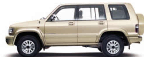
Satin Gold metallic

The Nullarbor may be in the middle of the wide brown land, but that doesn't mean it has to be plain.