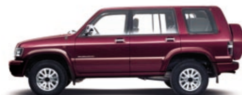
Foxfire Red mica