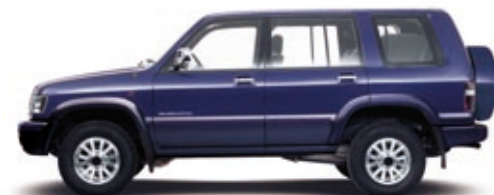
Empire Blue mica