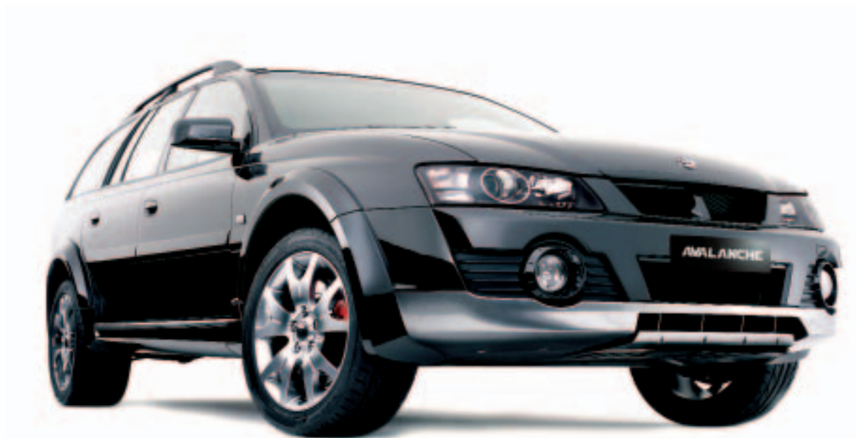
AWD Performance Braking System with massive 336 x 32mm 'AP Racing' ventilated and grooved front discs, HSV-embossed twin piston "Corvette" front calipers in HRT red, 315 x 18mm ventilated and grooved rear discs.

In every HSV you can discern the influence of the unique relationship HSV enjoys with the Holden Racing Team, and the remarkable AWD Avalanche is no exception. We have a shared passion - to excel at building wonderful motor cars. Every Avalanche is individually numbered and hand-assembled by experienced HSV craftsmen, and certified to Holden's exacting quality and durability standards. This commitment to quality and performance is evident in every area of the car. Dynamic safety, for example, is a key motivator.