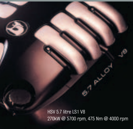
HSV 5.7 litre LS1 V8 270kW @ 5700 rpm, 475 Nm @ 4000 rpm