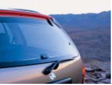
Dust deflector with stop lamps For those dusty back roads Flared wheel arches Looks tough enough for any road Roof rails Up there for thinking Chromed Exhaust Twin Tips Only because they're more durable, of course Aluminium plates and rocker inserts Helps keep the vitals intact

Long Weekend, 2pm This is an unexpected Adventra. We decide to go mountain biking, but he keeps finding excuses to go further and further. He keeps explaining why this road isn't good enough, or that track isn't steep enough. Mind you, the scenery is great, he's relaxed. Let him talk! This Adventra can handle any unexpected ramble!