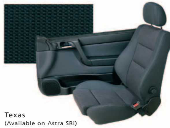
Texas (Available on Astra SRi)