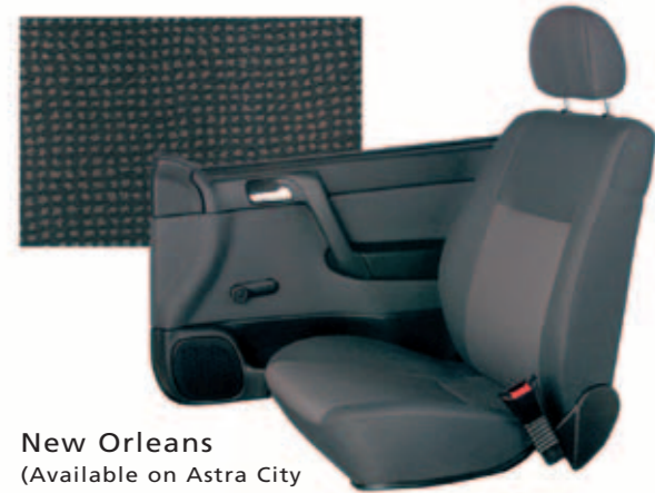
New Orleans (Available on Astra City and SXi)