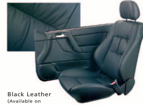
Black Leather (Available on Astra SRi Turbo)