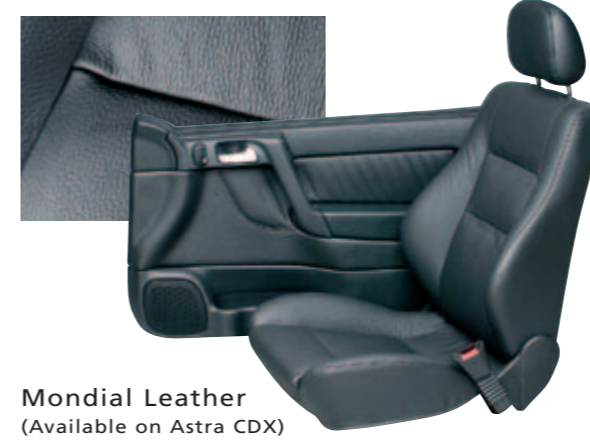
Mondial Leather (Available on Astra CDX)