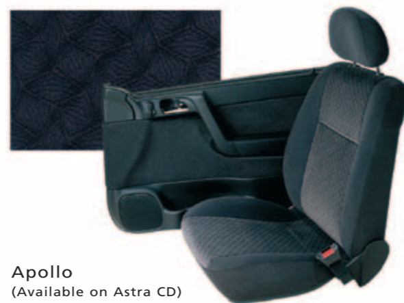
Apollo (Available on Astra CD)