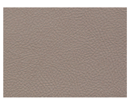
Light Reed leather