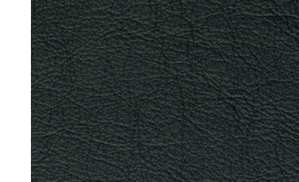
Neutral Pewter leather