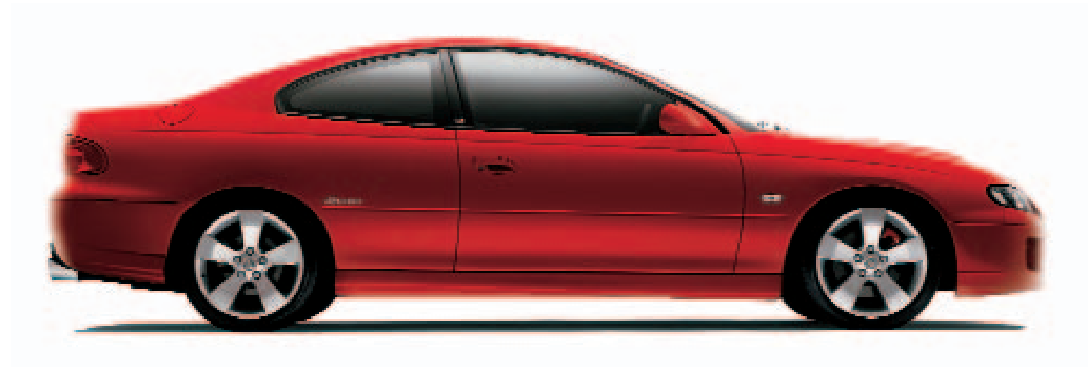
* Power and torque figures quoted with PULP

The shape. The sound. The urgent curves of Australia's unique sports coupe are equalled by the increased muscle under the bonnet. Listening to 5.7 litres of high output Generation III V8 engine – now massaged to a mighty 260kW* and 500Nm* – as it burbles through a true dual exhaust system, is a purist's earful. With its ground-hugging stance the new Monaro is as savage as it is sophisticated.