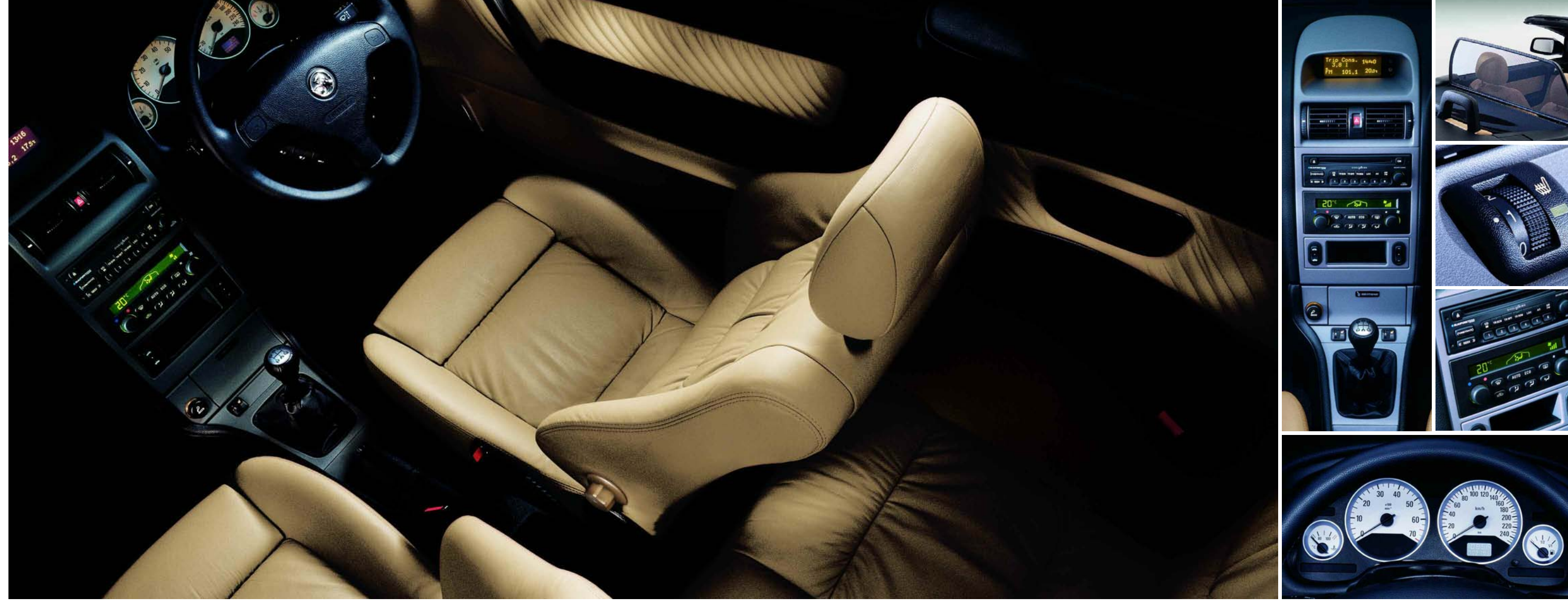
THE PLACE TO BE This is where you'll be spending your time – and you won't want to leave. Astra Convertible's interior was designed to delight, so all of its luxuries come as standard. Generously appointed, it boasts all leather trim and heated leather sports seats in the front, so that endless hours of driving pass in complete comfort. Classic sports car touches, such as white instrument dials with silver rings, make the Astra Convertible elegant to the last detail. The CD player comes to life through its premium 6-speaker Blaupunkt sound system. And audio controls are conveniently mounted on the steering wheel, so you can adjust and change music without taking your hands off the wheel, or your mind off the road.