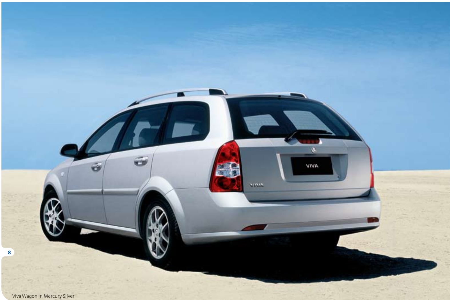
Viva Wagon in Mercury Silver