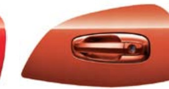
Sunset Orange Metallic