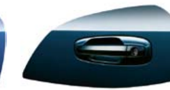
Dark Turquoise Metallic