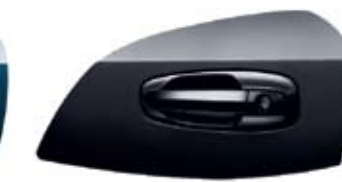
Jet Black Metallic