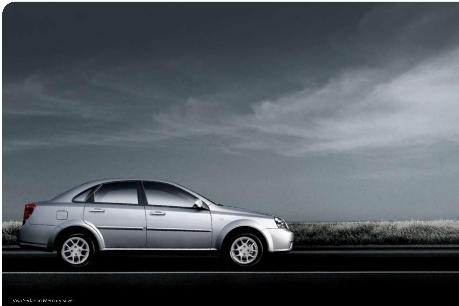
Viva Sedan in Mercury Silver