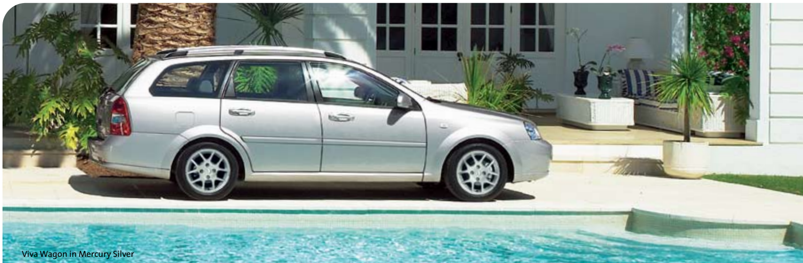
Viva Wagon in Mercury Silver