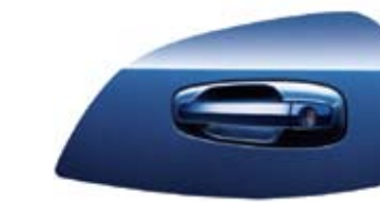
Impact Blue Metallic