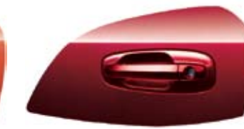
Royal Red Metallic