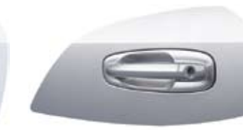
Mercury Silver Metallic