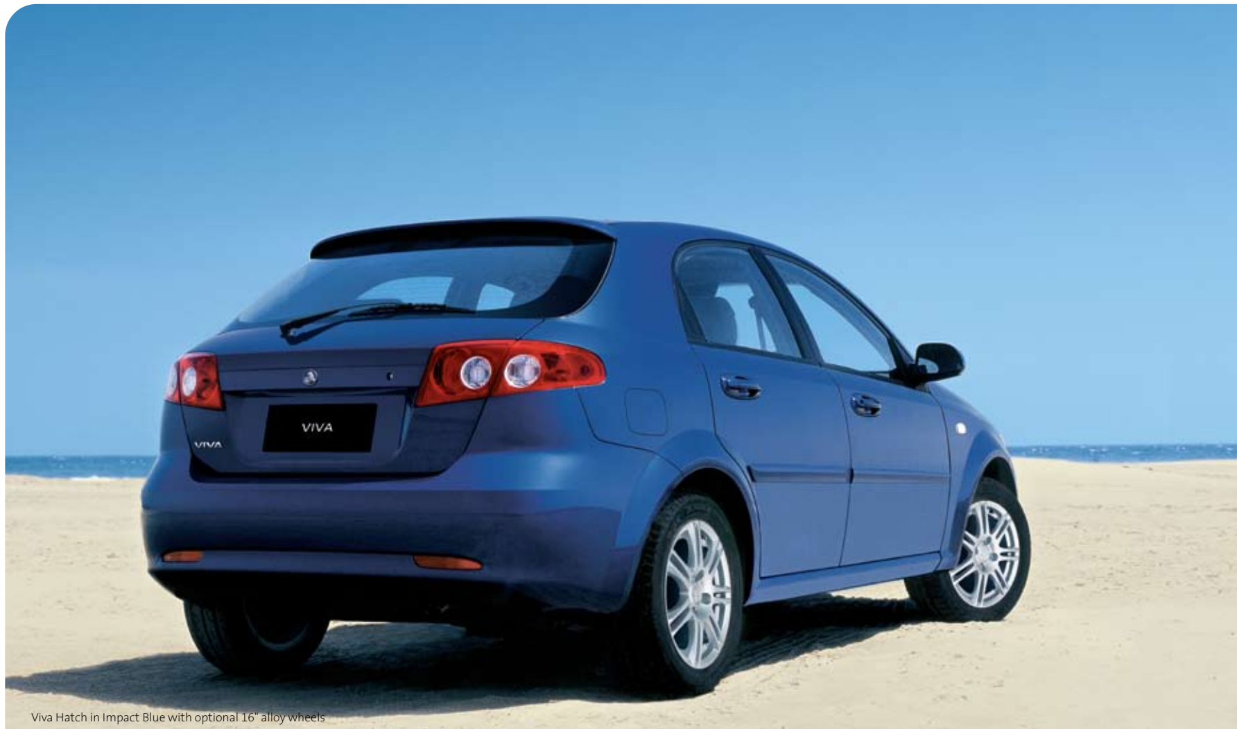
Viva Hatch in Impact Blue with optional 16" alloy wheels