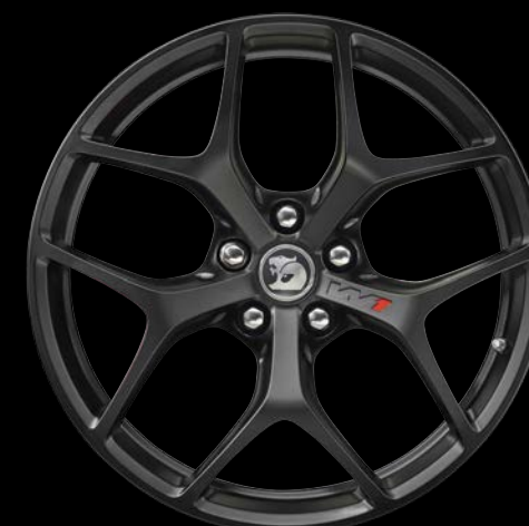
20" SV PANORAMA FORGED ALLOY WHEEL FINISHED IN MATTE BLACK GTSR W1