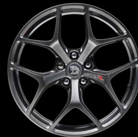
20" SV PANORAMA FORGED ALLOY WHEEL FINISHED IN HYPER DARK STAINLESS GTSR AND GTSR MALOO

The complimentary inspection is due at 1 month of owning your new HSV. The first service is due at 15,000km or 9 months (whichever occurs first). Thereafter at every 15,000km or 9 months since the last service (whichever occurs first). Additional services are required under certain driving conditions, such as when towing (refer owner's handbook).