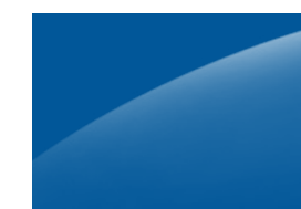
Hyper Blue Metallic*