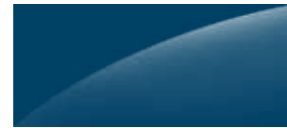
Deep Ocean Blue Metallic