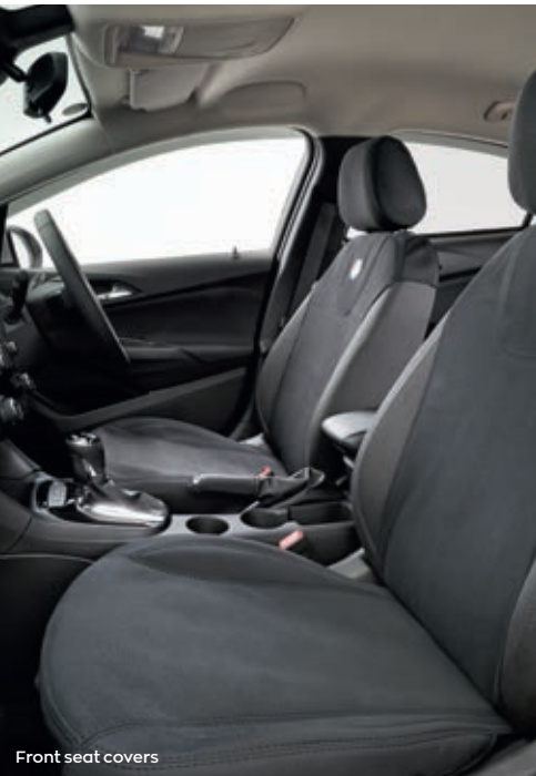
Front seat covers