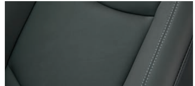
Jet Black leather-appointed trim