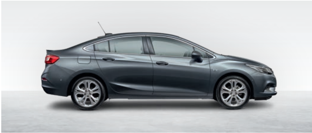
Satin Steel Grey