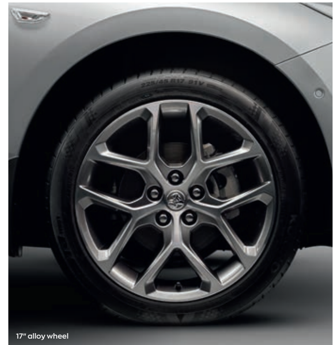
17" alloy wheel