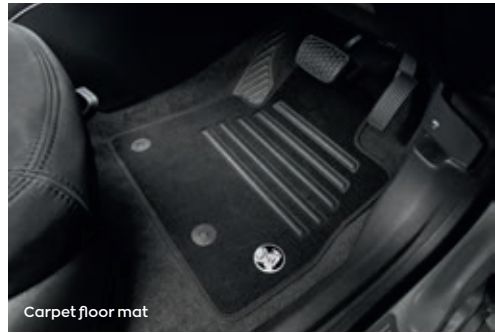
Carpet floor mat