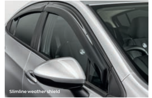
Slimline weather shield