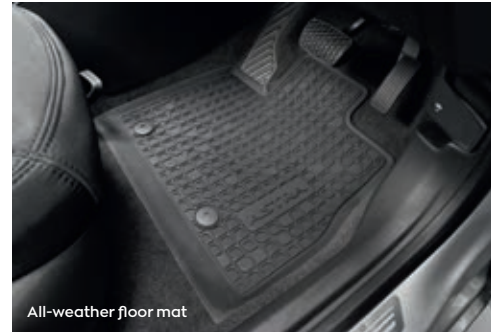
All-weather floor mat