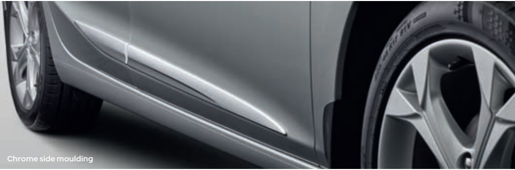
Chrome side moulding