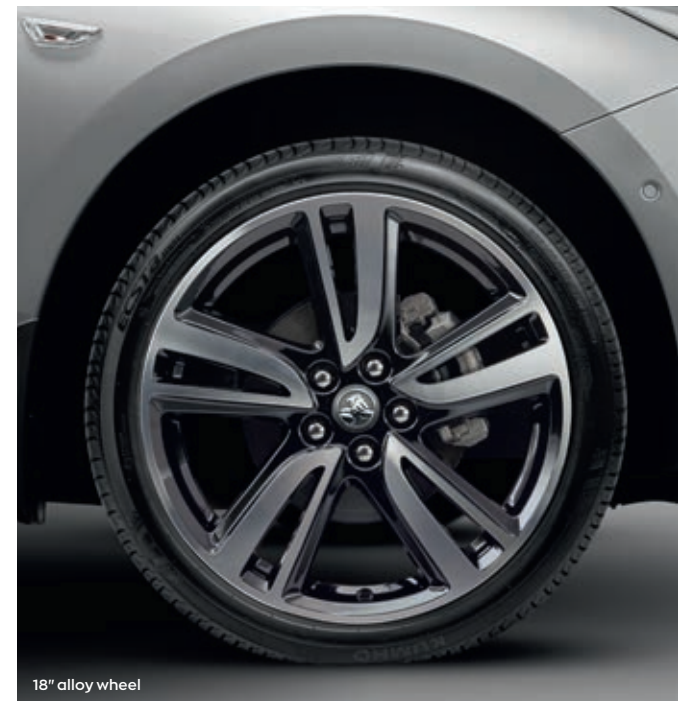
18" alloy wheel