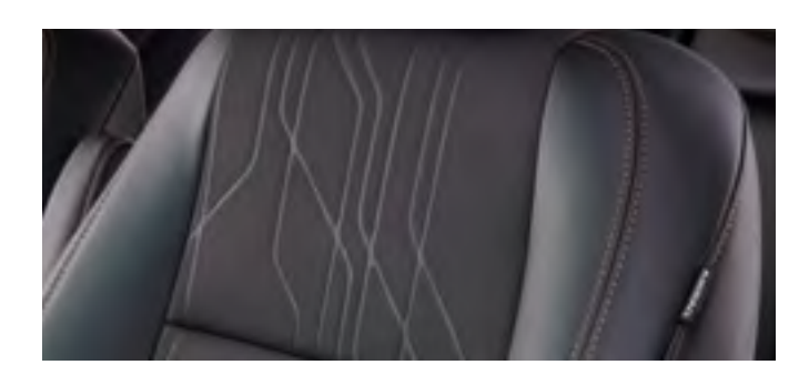
Cloth seat trim with Sportec bolsters