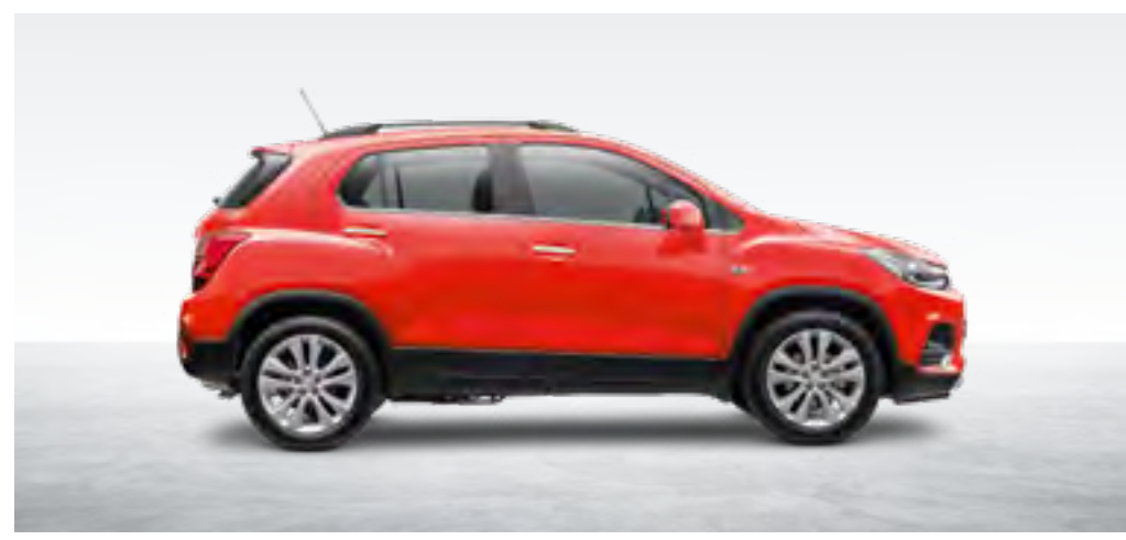
Mineral Black* Absolute Red^