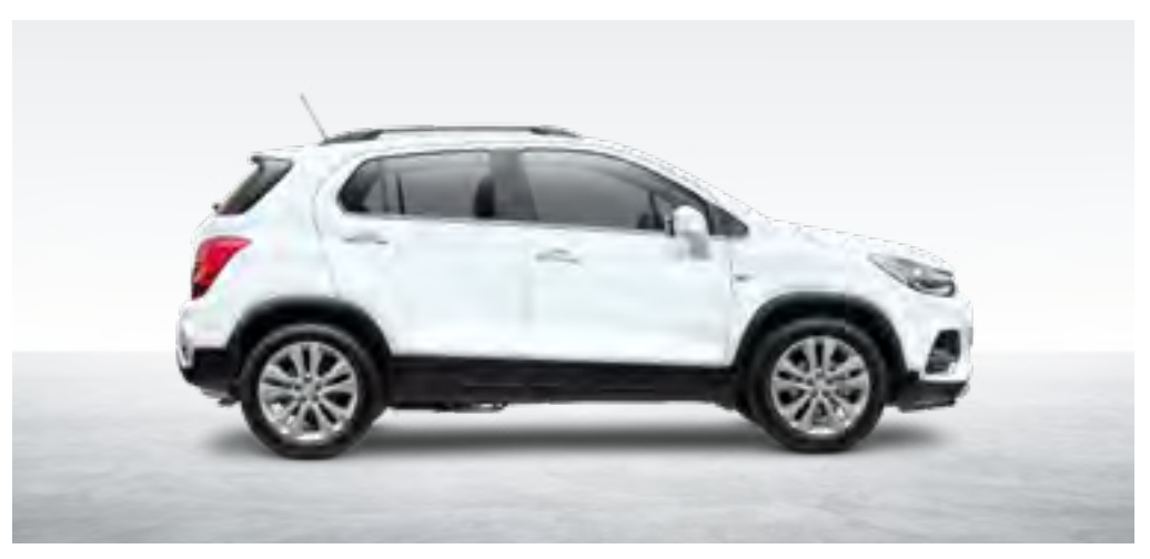
Satin Steel* Abalone White*