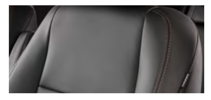
Jet Black Sportec