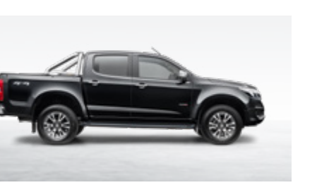
4 Crew Cab