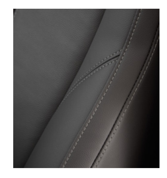
Jet Black Leather-appointed - Z71 & LTZ/LTZ+ 4x4 Crew Cab