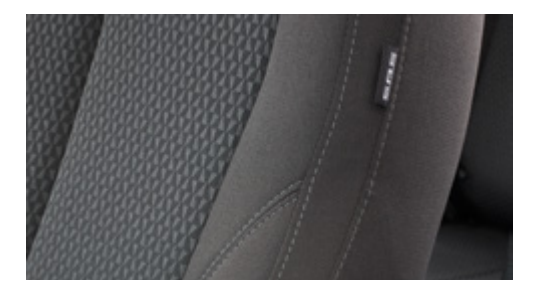
Jet Black Cloth - LTZ Space Cab & 4x2