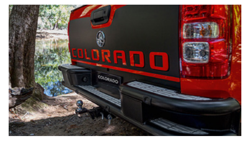
Rear Steel Step, Colorado Decal and Towing Package