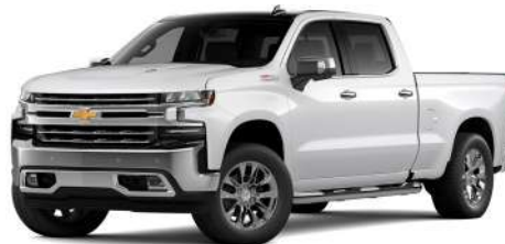
TRICOAT IRIDESCENT PEARL 1