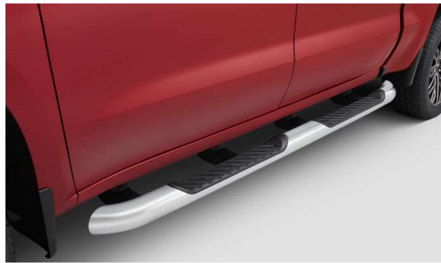
Sidestep Available in Black or Chrome