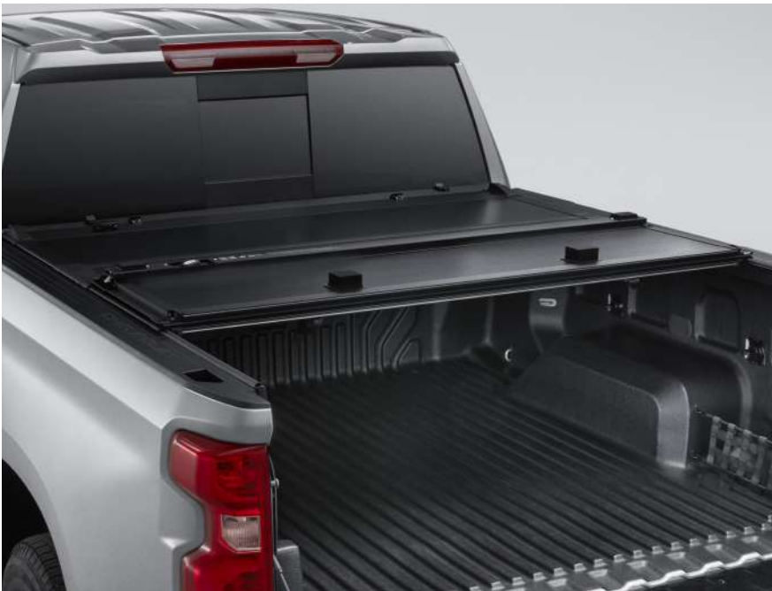
Tonneau – Trifold