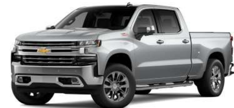
METALLIC SILVER ICE 1