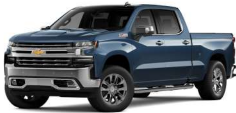
METALLIC NORTH SKY BLUE 1