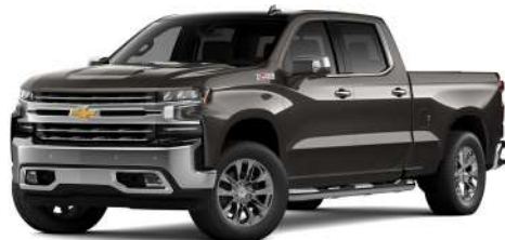
METALLIC OXFORD BROWN 1