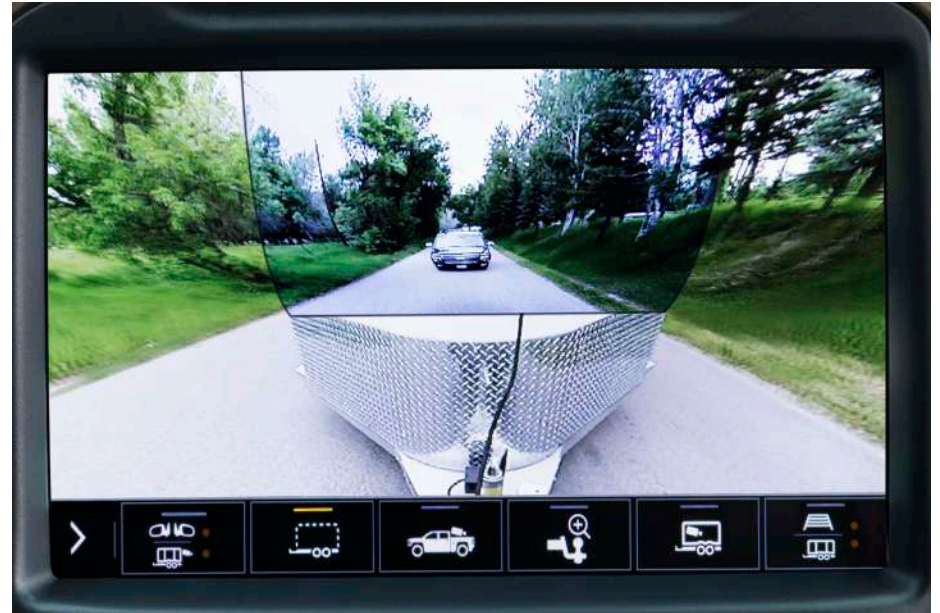
Trailer Camera - Silverado LTZ Premium Only