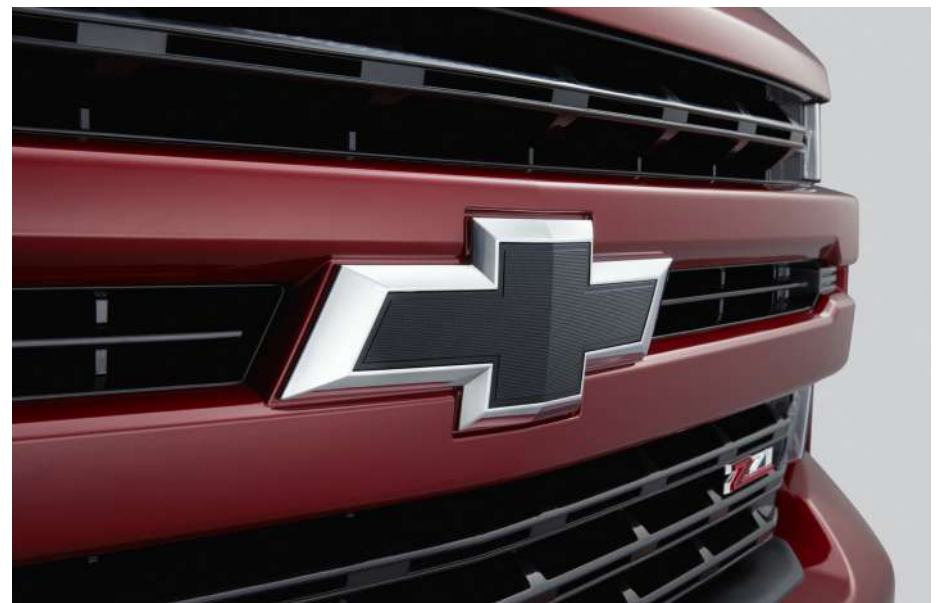
Black Front Bow Tie Badge