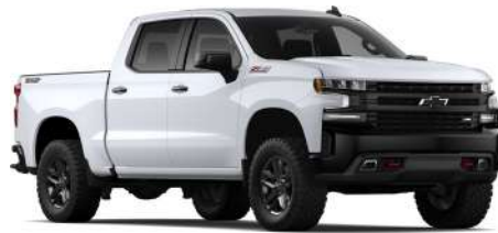
STANDARD SUMMIT WHITE