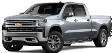
METALLIC SATIN STEEL GREY 1