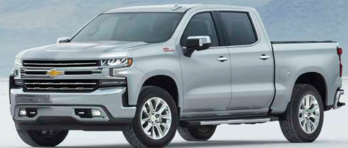
SILVERADO LTZ PREMIUM