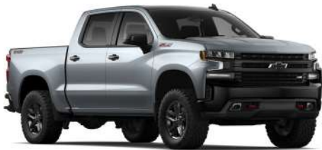
METALLIC SATIN STEEL GREY 1