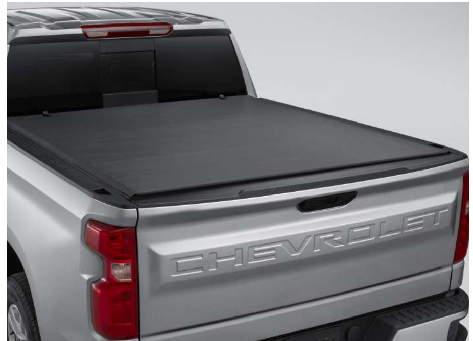
Soft Roll-Up Tonneau Cover