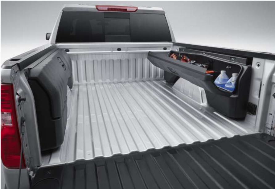
Tub Boxes – Side Mounted