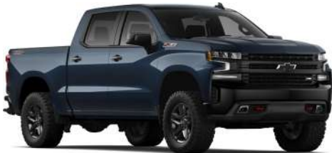
METALLIC NORTH SKY BLUE 1