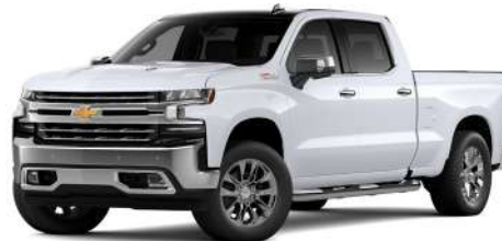
STANDARD SUMMIT WHITE