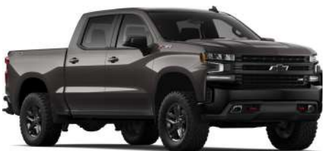
METALLIC OXFORD BROWN 1