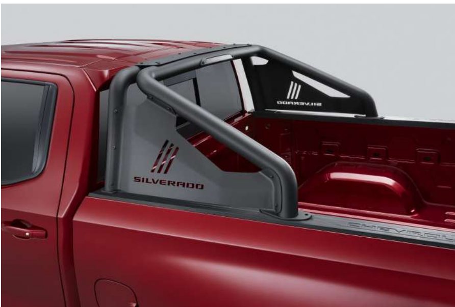
Sports bar - Silverado LT Trail Boss Only