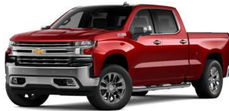
TINTCOAT CHERRY RED 1