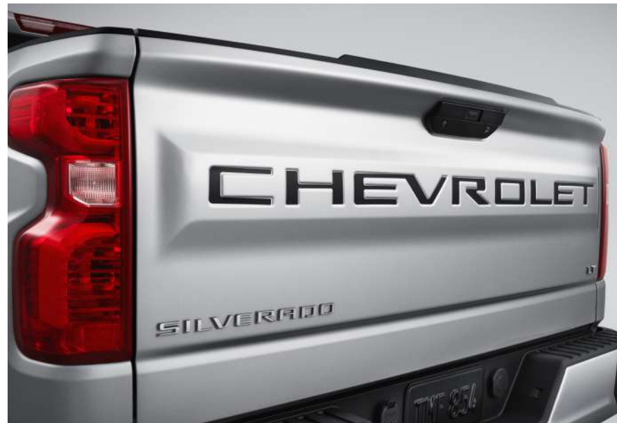
Personalised Black Lettering Combinations Black Chevrolet Lettering Tailgate or Black Lettering Kit