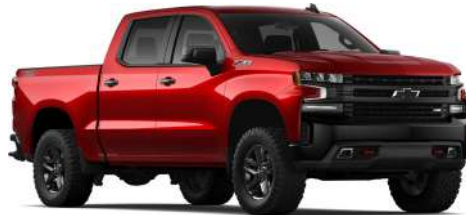
TINTCOAT CHERRY RED 1