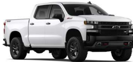
TRICOAT IRIDESCENT PEARL 1