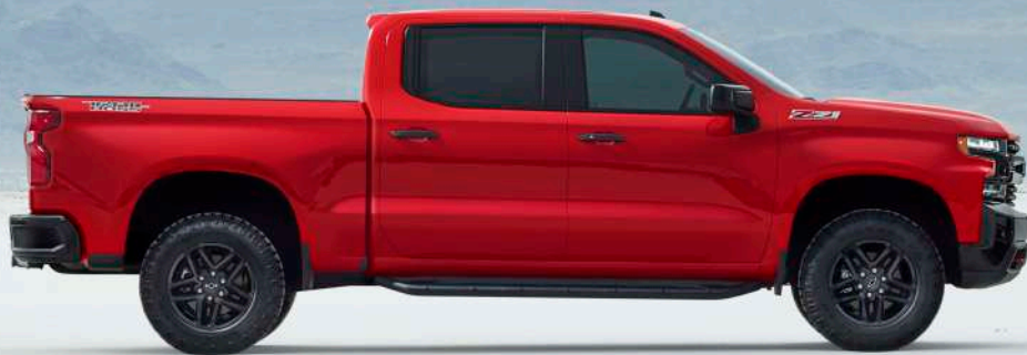
SILVERADO LT TRAIL BOSS