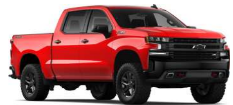
RED HOT 1