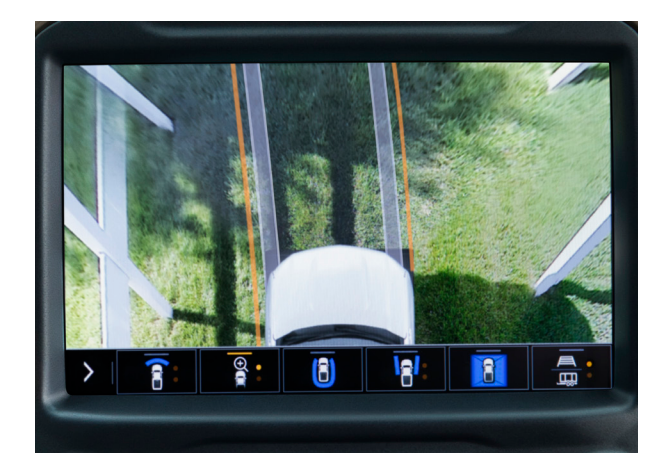
Front Top-Down View<sup>1</sup> Provides a top-down view of the hood, bumper and front tires for tight maneuvers in parking lots or along curbs. Includes guidelines that can be turned on or off as necessary.