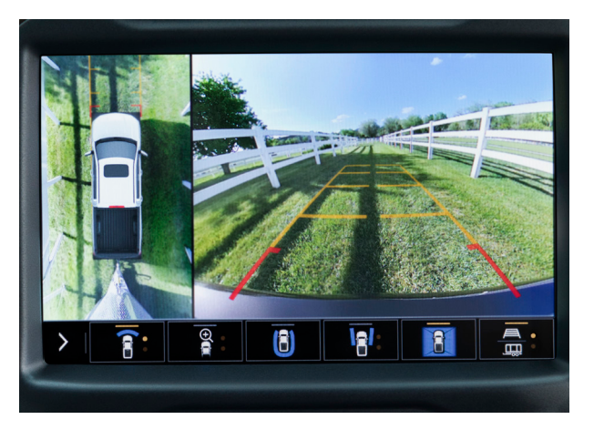
Surround View¹ Gives a top-down bird's-eye view of the truck's surroundings.