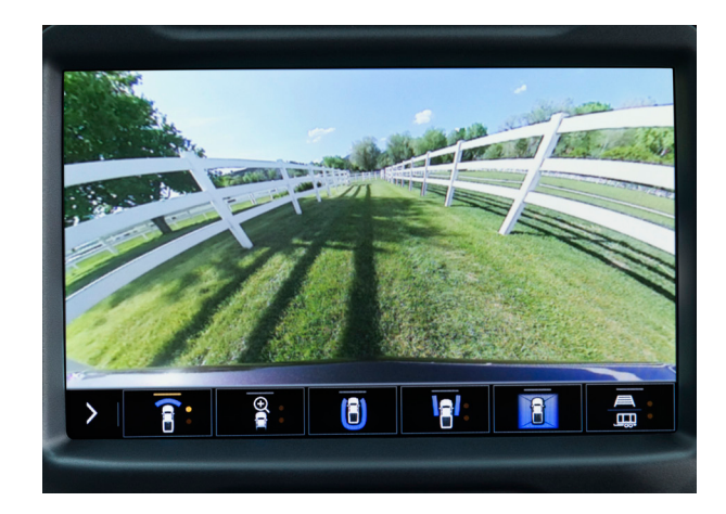
Front Camera View <sup>1</sup> Displays a view in front of the truck with available guidelines to assist with parking and tight maneuvers.