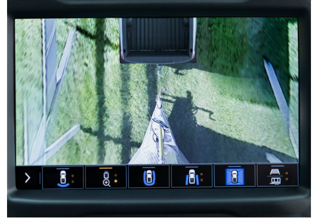
Rear Top-Down View <sup>1</sup> Shows the clearance between the truck bed and nearby objects.