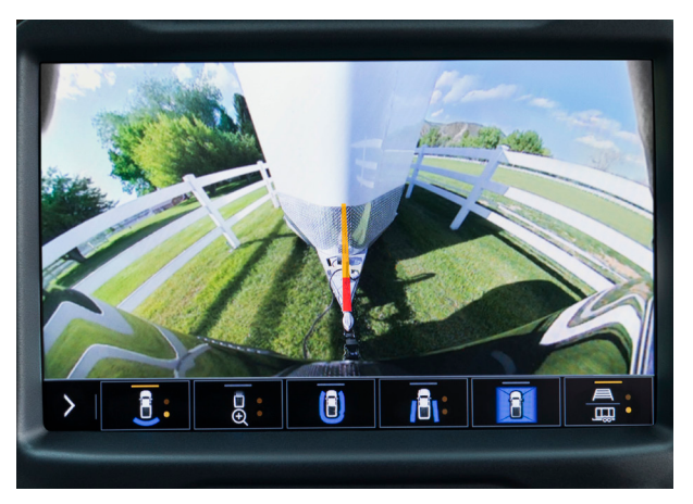
Rear Camera View Displays a view behind the truck with available guidelines to assist with parking and tight maneuvers or to hitch a trailer.