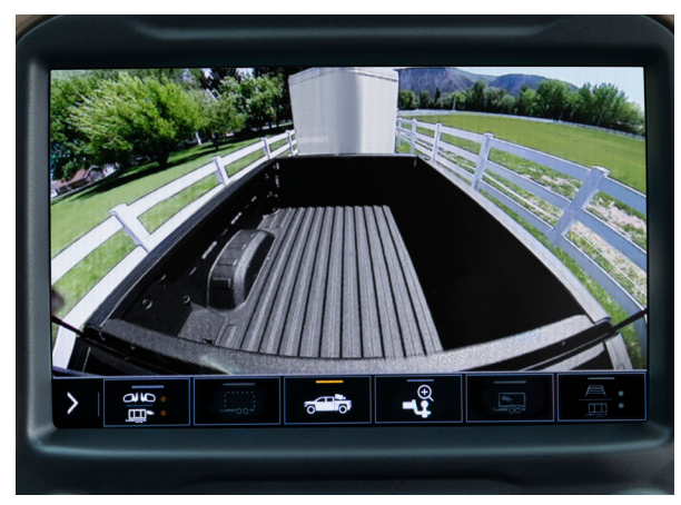
Bed View <sup>1</sup> Allows you to see the cargo bed to help with fifth-wheel or gooseneck hitching or to briefly check on cargo.