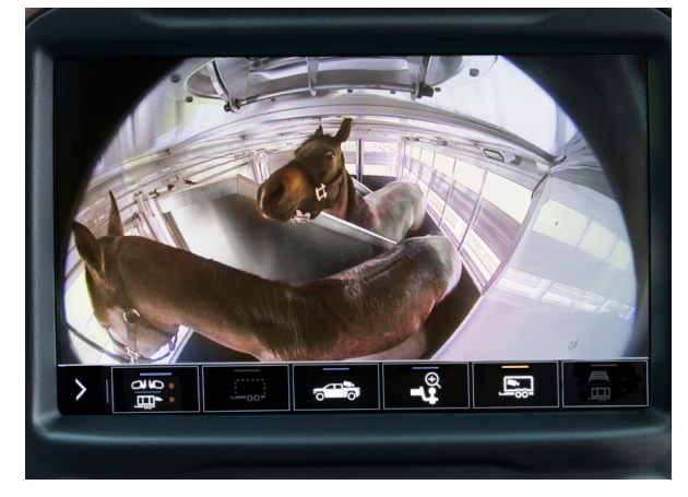
Inside Trailer View<sup>2</sup> Allows the driver to monitor trailer contents or cargo using an available Accessory Camera that can be installed in the trailer.