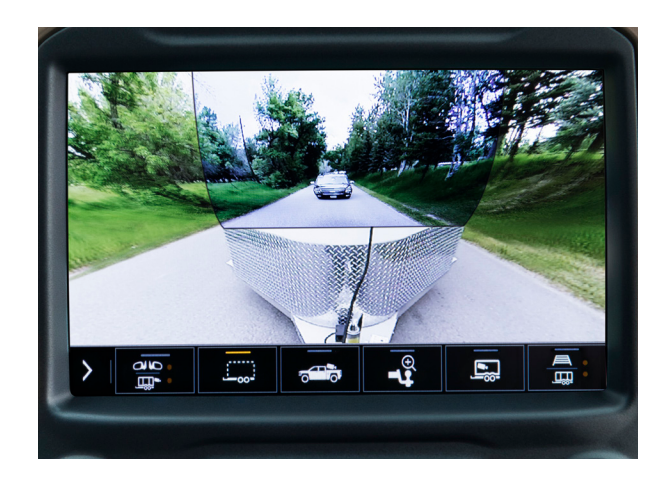
Transparent Trailer View <sup>2</sup> Allows the driver to virtually "see through" a compatible trailer.