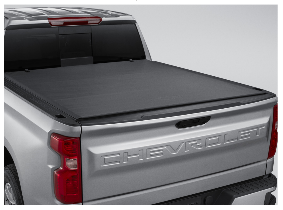
Soft Roll-Up Tonneau Cover