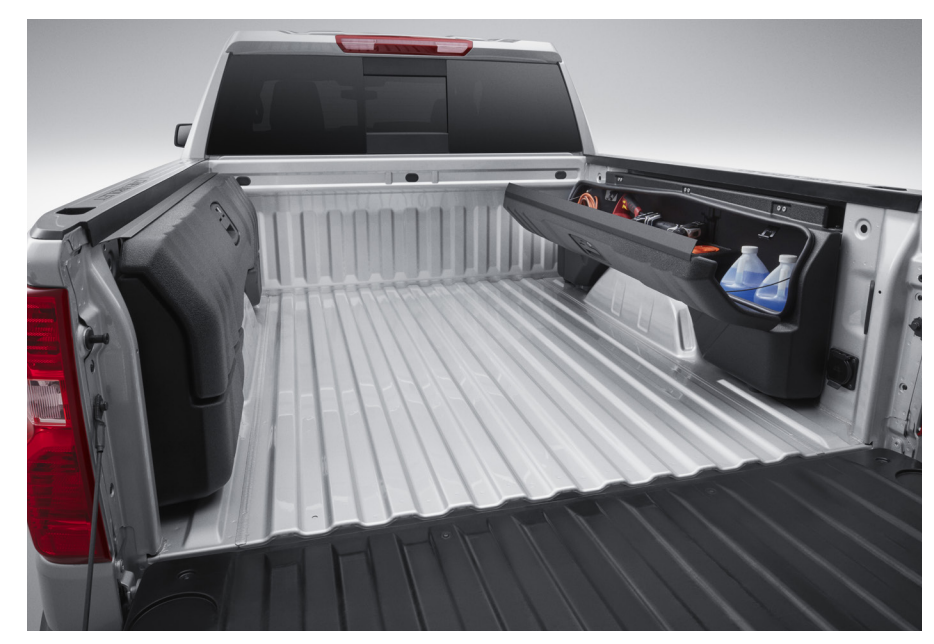
Tub Boxes - Side Mounted