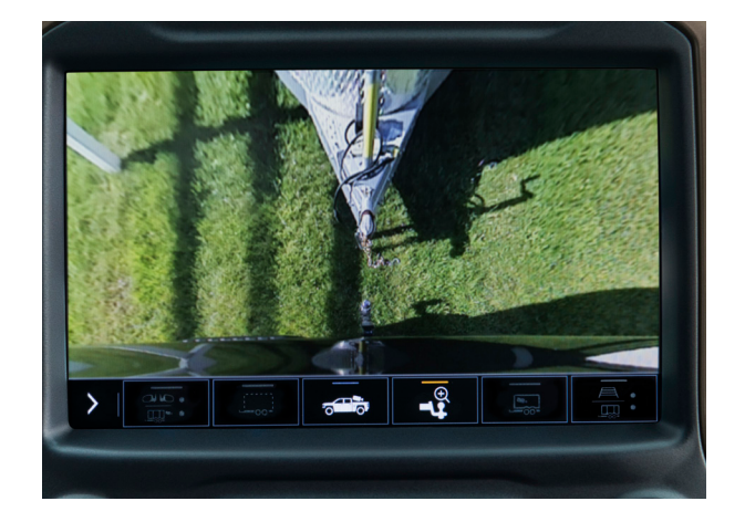
Hitch View <sup>1</sup> Provides a close-up view of the receiver hitch to help with alignment when connecting to a trailer.