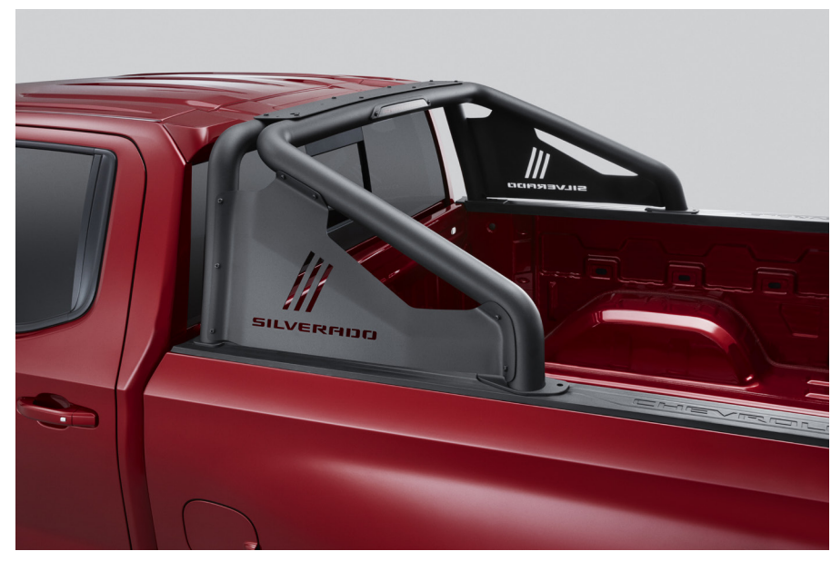
Sports bar - Silverado LT Trail Boss Only