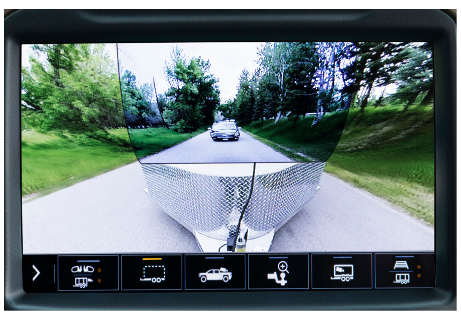
Trailer Camera - Silverado LTZ Premium Only