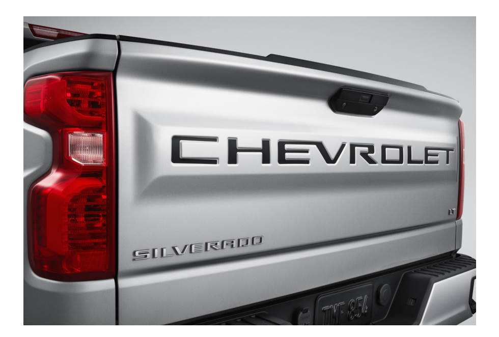
Personalised Black Lettering Combinations Black Chevrolet Lettering Tailgate or Black Lettering Kit