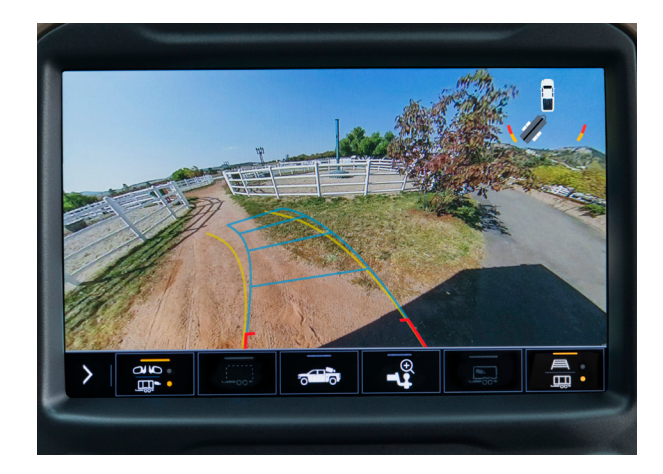
Rear Trailer View<sup>2</sup> Uses an available accessory camera to show objects behind a compatible trailer. Trailer Angle Indicator<sup>2</sup> with Trailer Guidelines<sup>2</sup> shows your current path. A second set of guidelines shows