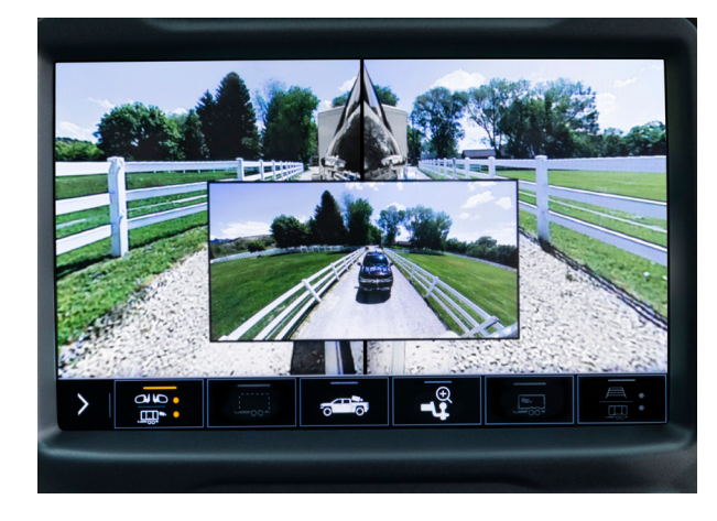
Pic-In-Pic Side View <sup>2</sup> Combines two views — the Rear Side View and the Rear Trailer View. Requires available Accessory Camera.