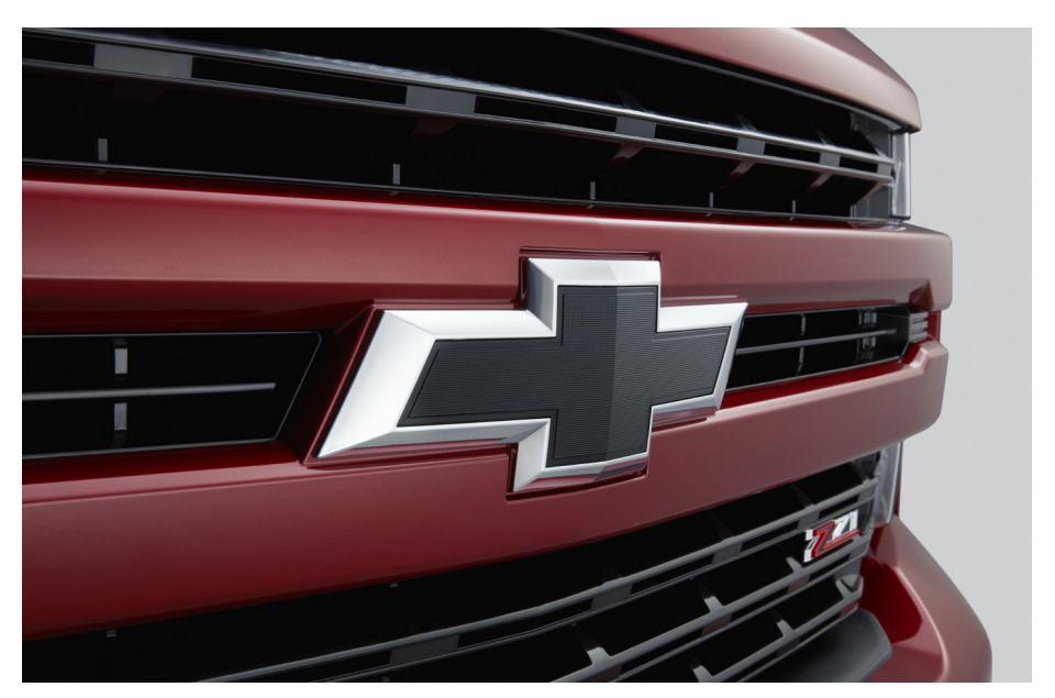
Black Front Bow Tie Badge