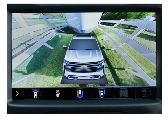
Bowl View <sup>1</sup> Provides a rear-facing 3-D surround view, useful for low-speed backing maneuvers.