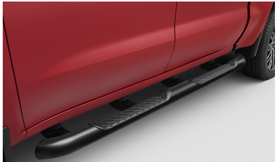
Sidestep Available in Black or Chrome