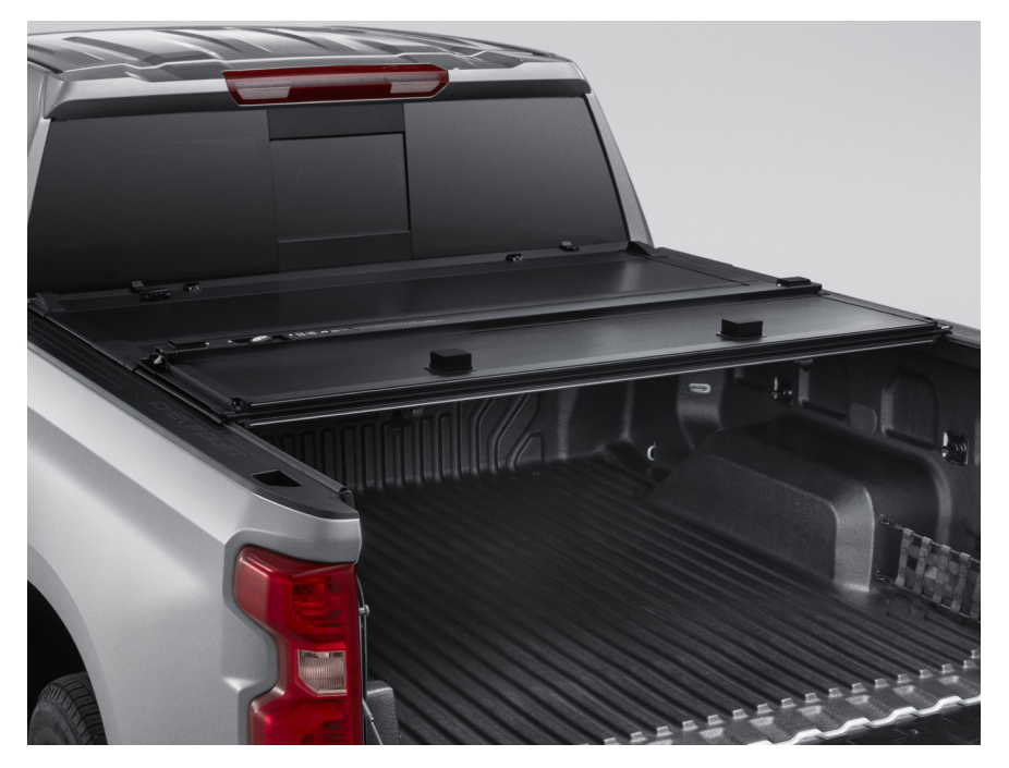
Tonneau - Trifold