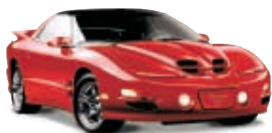
Shown: Trans Am Coupe, in Bright Red with WS6 Performance and Handling Package.