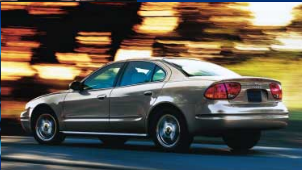
Alero GL1 Sedan in Sandstone.

* Maintenance needs vary with different uses and driving conditions. See the Owner's Manual for more information.