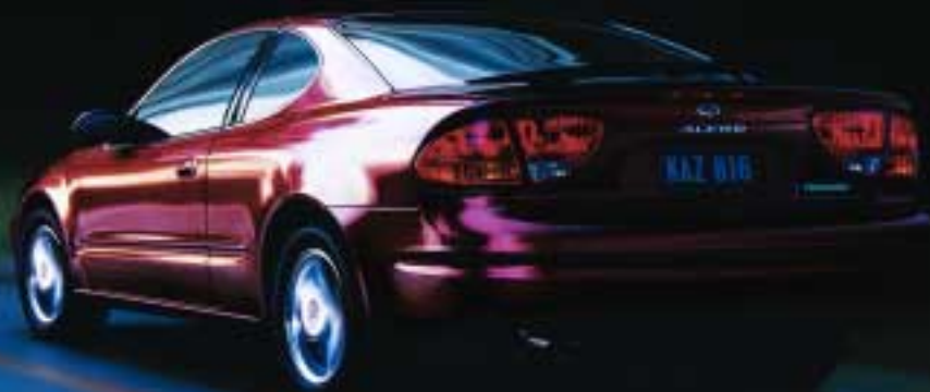
Oldsmobile Alero GL2 Coupe in Ruby Red.