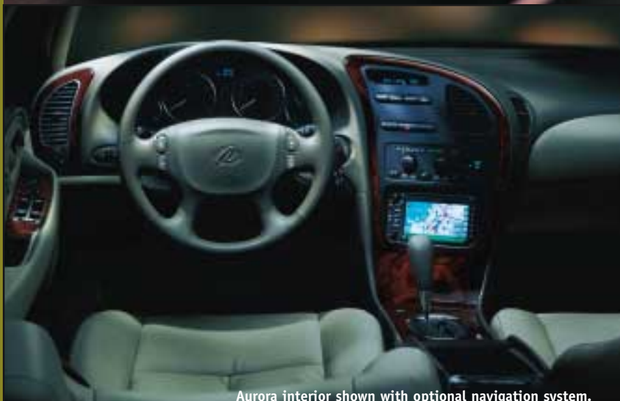
Aurora interior shown with optional navigation system.

Luxury makes a powerful statement in Aurora. ® Rich leather-trimmed seats and burled walnut accents surround you, while a standard electronic climate control helps keep you comfortable. This is one luxury car that performs, with a 4.0 Liter Aurora V8 that puts out 250 horsepower. And the standard Precision Control System helps you stay on track and in control. Plus you have the confidence of a 5-year/60,000-mile GM Protection Plan, ® or you can choose additional cash in lieu of the GMPP.*