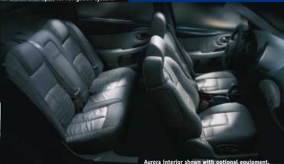
Aurora interior shown with optional equipment.

*Take delivery by 10/01/03. General Motors Protection Plan Major Guard coverage for 5 years/60,000 miles (whichever comes first) effective from the date of delivery and 0 miles. Excludes normal maintenance. Some restrictions apply. See dealer for complete Major Guard details and details about cash alternative. In Florida, coverage is provided by the Oldsmobile 60-month/60,000-mile Limited Warranty. See Florida dealer for complete limited warranty details.