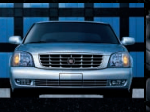
DeVille DTS shown in Light Platinum.

DeVille DTS shown in Light Platinum with optional equipment.