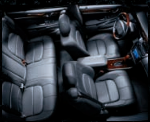
DeVille DTS interior shown.