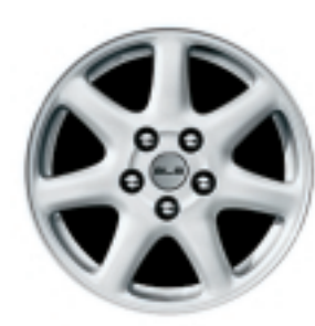
16" CAST-ALUMINUM WHEELS. STANDARD ON SEVILLE SLS.