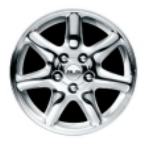
16" CHROME-PLATED CAST-ALUMINUM WHEELS. AVAILABLE ON SEVILLE SLS.