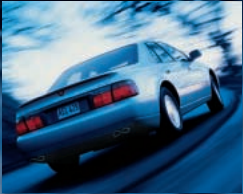
Seville SLS shown in Cashmere with optional equipment.

Simple, bold strokes state the theme: Cadillac® Seville® is about power and technology. The careful balance of strength with grace. What's more, the Northstar® engine control system actually integrates the functions of the vehicle's ABS, all-speed Traction Control, active suspension, advanced stability enhancement system and speed-sensitive steering. This array of advanced driving technology provides impressive control, ride and handling, leaving you free to focus on sheer exhilaration. Amid fine leather and selected woods, Seville creates a pulse-quickening driving experience.