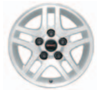
ALUMINUM WHEEL STANDARD ON ZR5 CREW CAB

1 Manufacturer's Suggested Retail Price as of 6/13/03. Includes $635 DFC. Tax, title, license and optional equipment are extra.