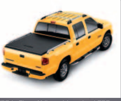
ZR5 in Flame Yellow with optional ZR5specific tonneau cover.