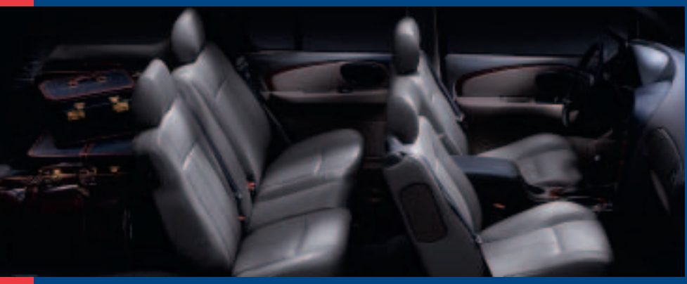
The Bravada interior shown with optional equipment.