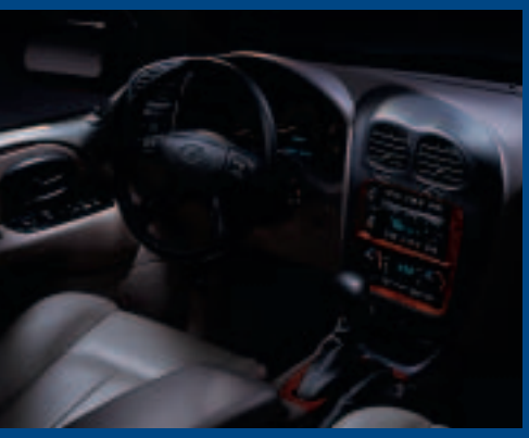
The Bravada instrument panel detail with optional equipment.

With its attentive appointments, highly refined road manners and silky-smooth power, the 2004 Bravada® gives new meaning to the term luxury sport utility . Settle into rich leather-trimmed seats and be surrounded by amenities like dual-zone electronic climate control and a programmable Driver Information Center. Feel the power of 275 horses. Feel confident that its Traction Assist (standard on 2WD models) or SmartTrak® (standard on AWD models) will help keep you in control. Plus you have the confidence of the 5-year/60,000-mile GM Protection Plan,® or you can choose additional cash in lieu of the GMPP.*