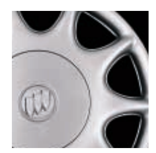
15" Deluxe cover; standard on Century and Custom Package.