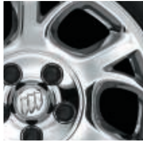
16" Special Edition Chrome-Plated; standard on Special Edition Package.