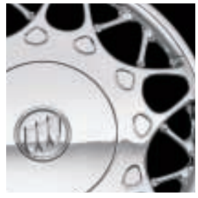
15" Chrome-Plated cover; available on Custom Package, standard on Limited Package.