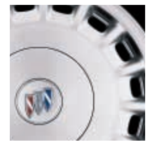
15" Aluminum; available on Custom and Limited packages.