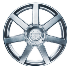
18-inch polished aluminum.