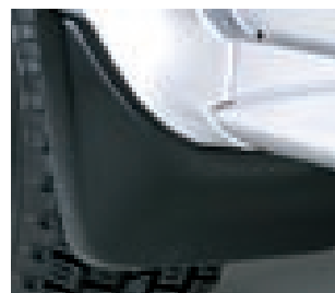
Front Mud Flap Moulded