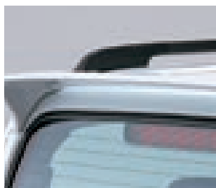
Rear Upper Spoiler