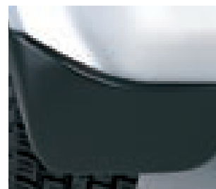
Rear Mud Flap Moulded