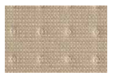
Beige Luna Cloth*