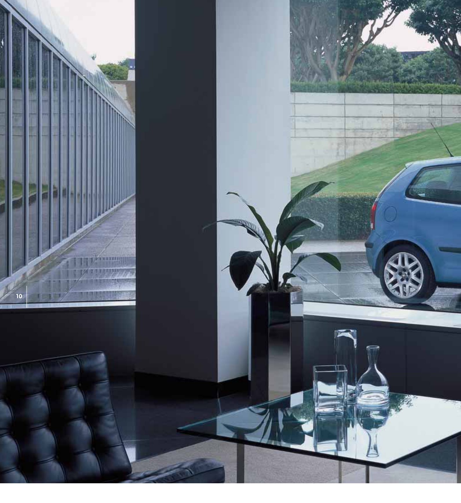
Alloy wheels shown are not available in Australia.