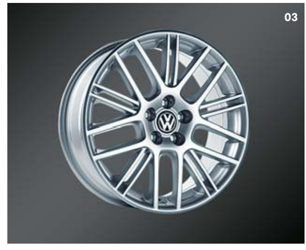
"Exor" 17" Alloy Wheel