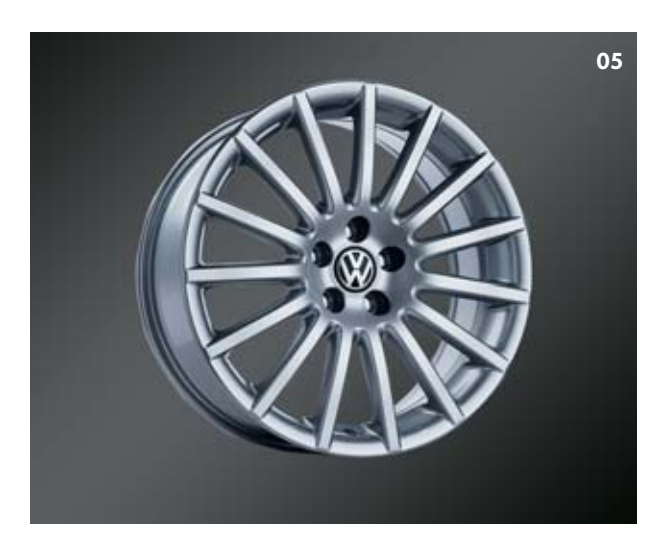
"R Line" 17" Alloy Wheel