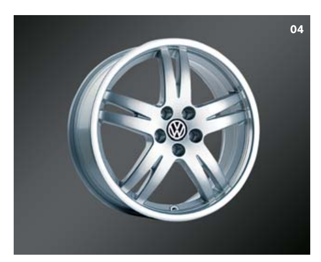
"Siata" 17" Alloy Wheel