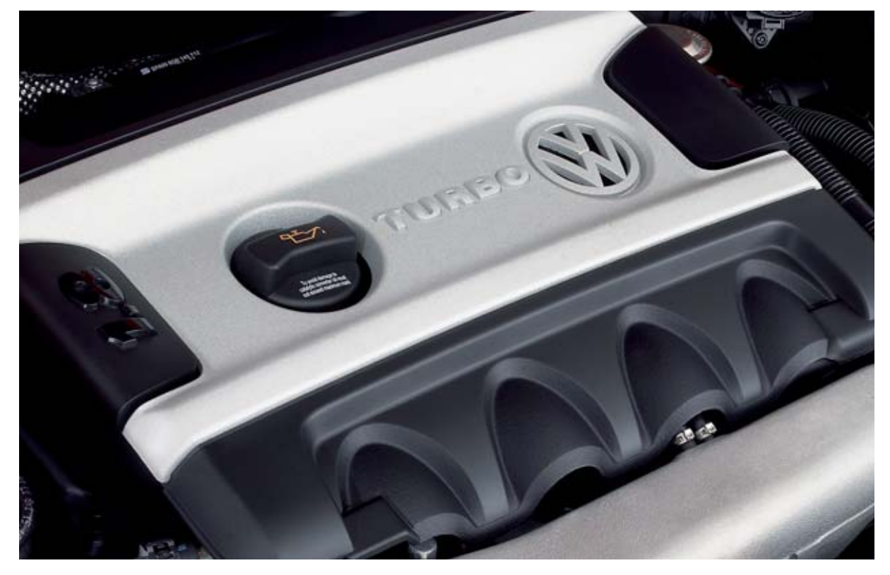
The Polo is powered by a 4 cylinder 1.81 turbo-charged petrol engine.