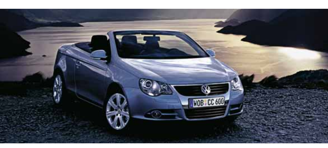
*Manual transmission. Fuel consumption figures according to Australian Design Rule (ADR) 81/01.

Volkswagen diesel engines will travel much further on a tank of fuel than an equivalent sized petrol engine. A Golf 1.9 TDI can travel up to a remarkable 1,000kms per tank*. A greater fuel range means fewer trips to the petrol station. For instance, a customer travelling 10,000kms per year may only need to refuel their Golf 1.9 TDI 10 times in that period.