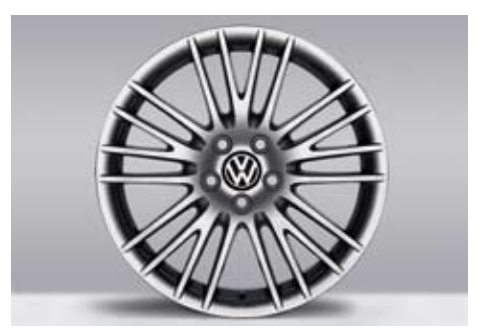
Alloy Wheel Velos (Titanium) 18 x 8"