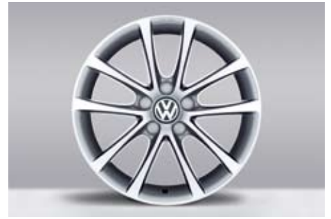
Alloy Wheel Azuro (Brilliant Silver) 17 x 7½"