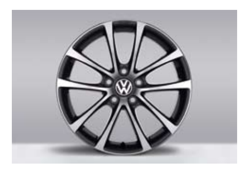
Alloy Wheel Azuro (Titanium) 17 \times 7\frac{1}{2} "