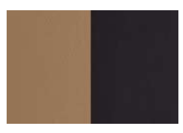
Eos Individual Titanium Black/Cinnamon Napa Leather