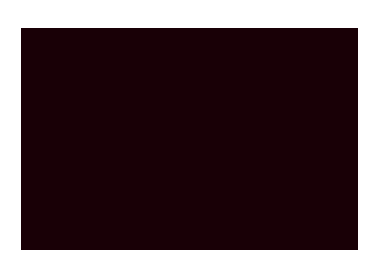
Samoa Red Pearl Effect