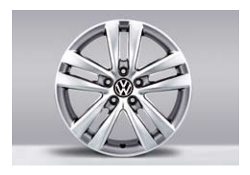
Alloy Wheel Akiros 17 x 7½"

Volkswagen has developed a choice of five attractively styled alloy wheels that compliment the unique styling of the Eos. They are pure in design, beautifully engineered and technically compatible with the Eos design for safe driving performance.