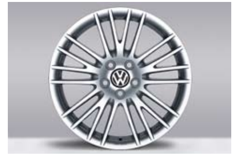
Alloy Wheel Velos (Brilliant Silver) 18 x 8"