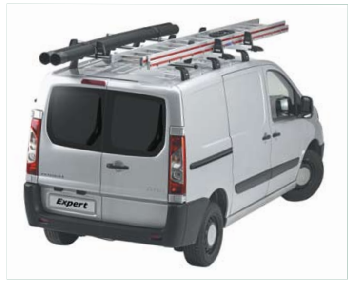
Roof Bars and a wide range of roof mounted accessories let you carry additional loads with complete safety.

Peugeot Accessories are designed specifically for each model, which means there are no compromises on fit or function. In addition, they are tested to our own high standards giving you complete confidence and piece of mind. Peugeot Accessories help equip your Expert van with all the comforts you'd expect of a mobile office. Your Peugeot Dealer can also assist you in selecting the fitout best suited to your business.