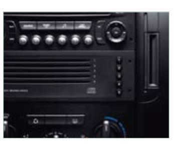
In-dash CD stacker