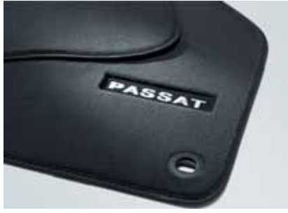
Carpet Floor Mats