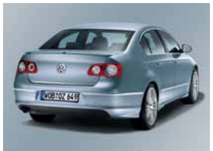
Body Kit, Rear