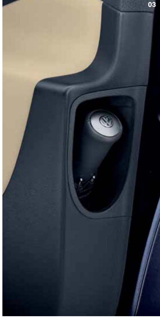
Umbrella shown is an optional merchandise product not included with the car.