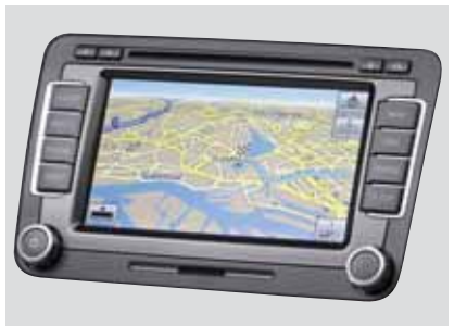
Satellite Navigation System