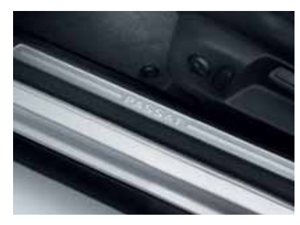
Door Sill Protective Strip