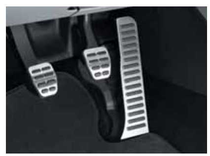
Stainless Steel Pedal Set