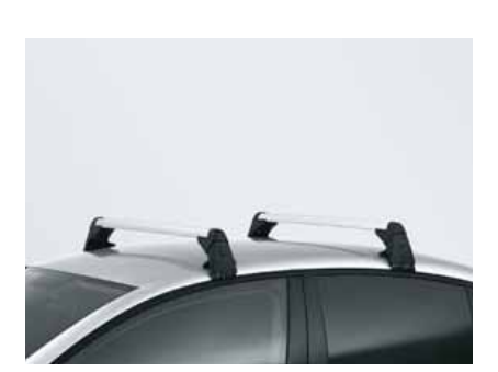
Roof Bar Set

For more information or to experience the full range of genuine accessories designed to suit the Passat, visit your local Volkswagen Dealer.