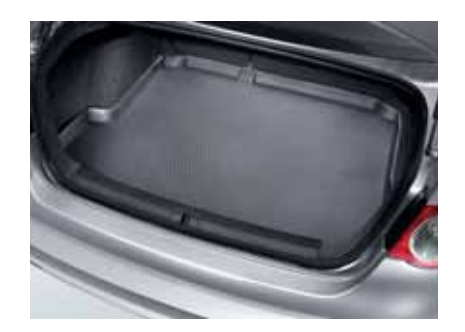
Boot Mat, Moulded Foam