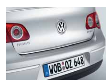
Rear Boot Trim, Chrome