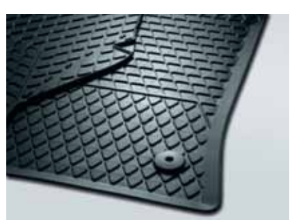
Rubber Floor Mats