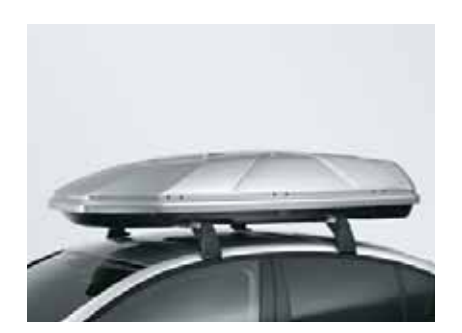
Ski and Luggage Box