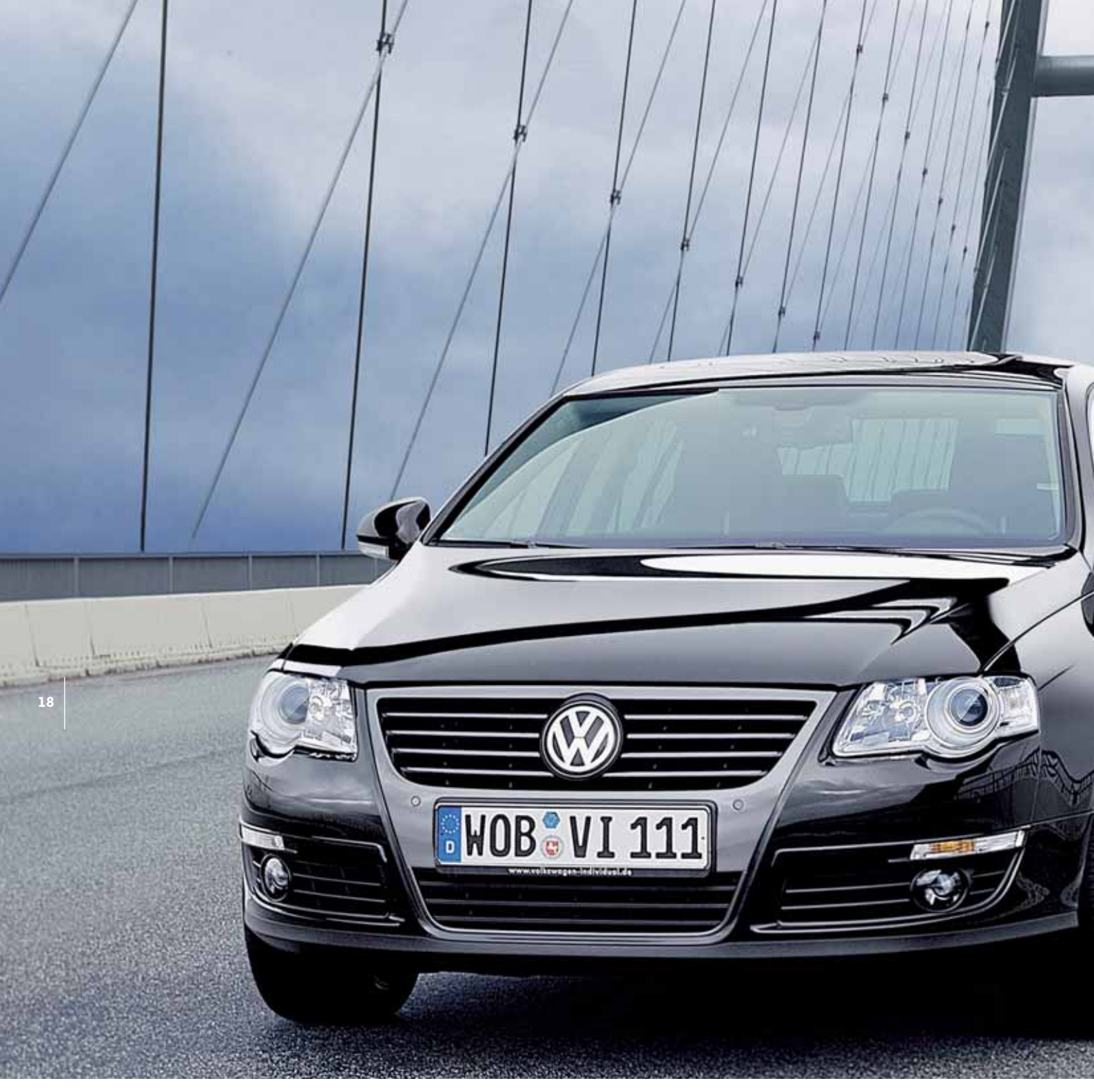
V6 FSI Highline shown