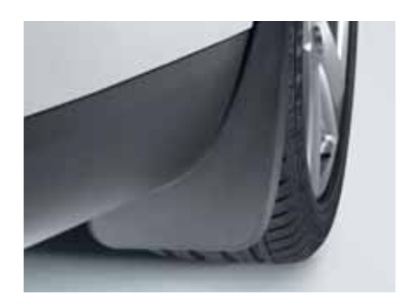
Front and Rear Mudflaps