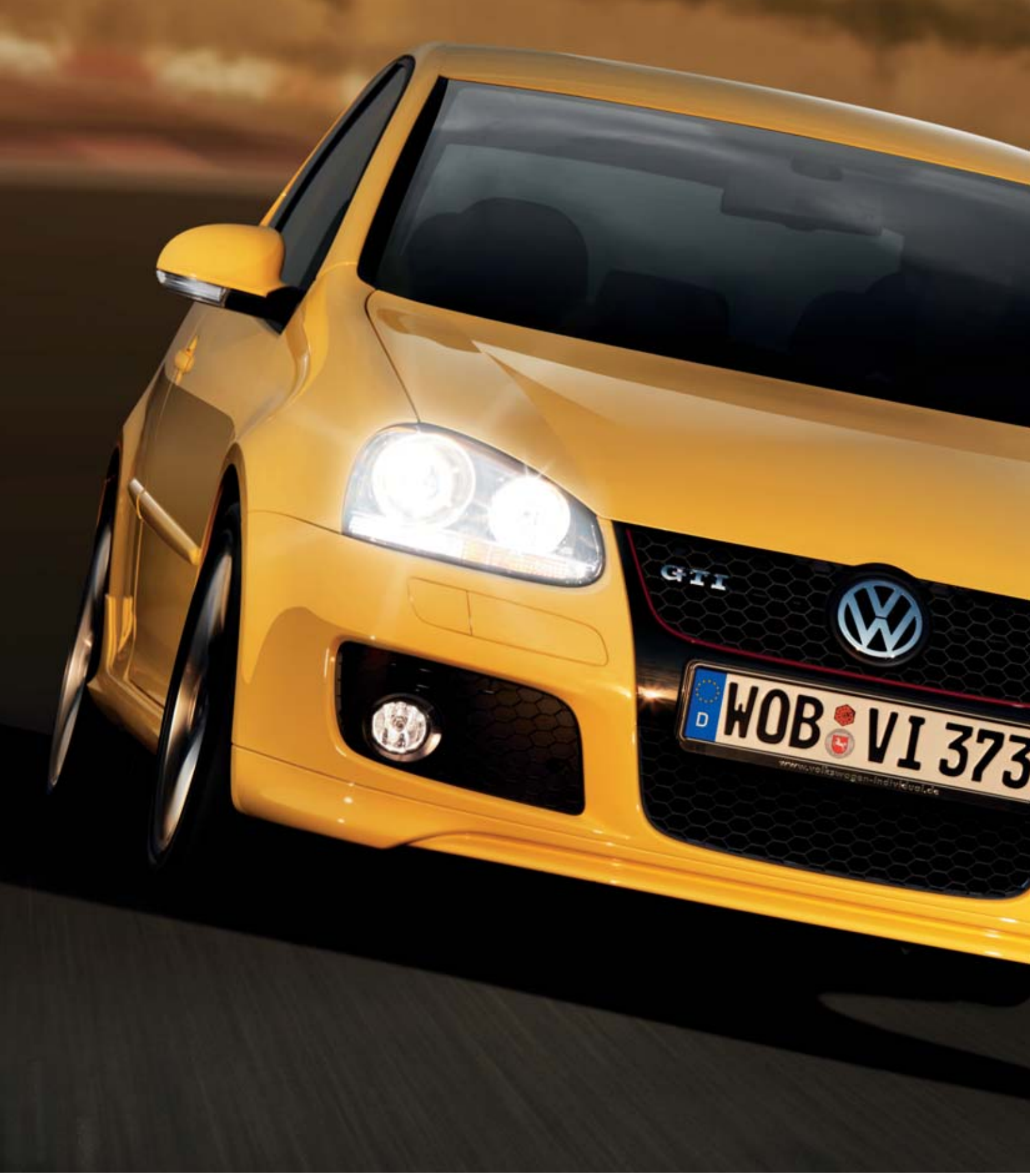
Overseas specification vehicles are shown in this brochure. Some features and options may not be available in Australia.