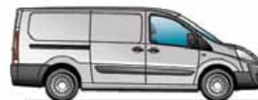
L2 Long wheelbase van