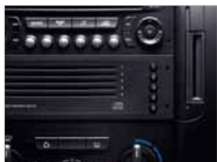
In-dash CD stacker