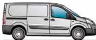
L1 Standard wheelbase van