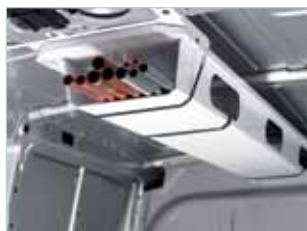
Long load tunnel