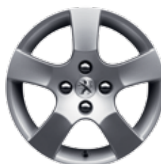
16" alloy wheel (XT)