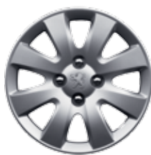
15" steel wheel (XR)