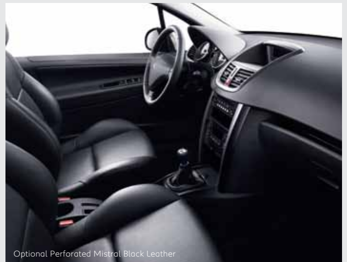
Optional Perforated Mistral Black Leather