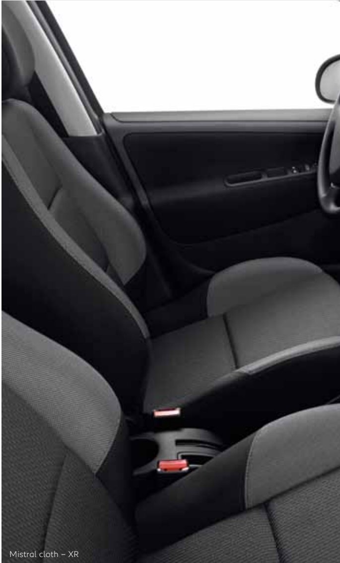
Mistral cloth - XR