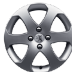
16" alloy wheel (Touring)