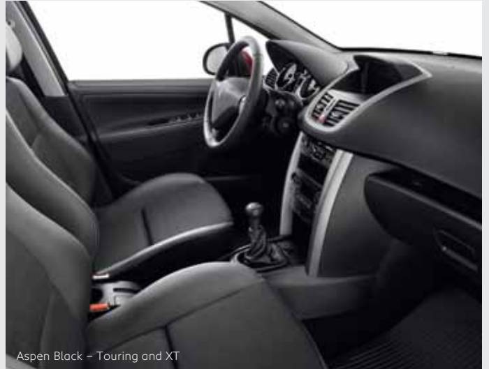
Aspen Black - Touring and XT