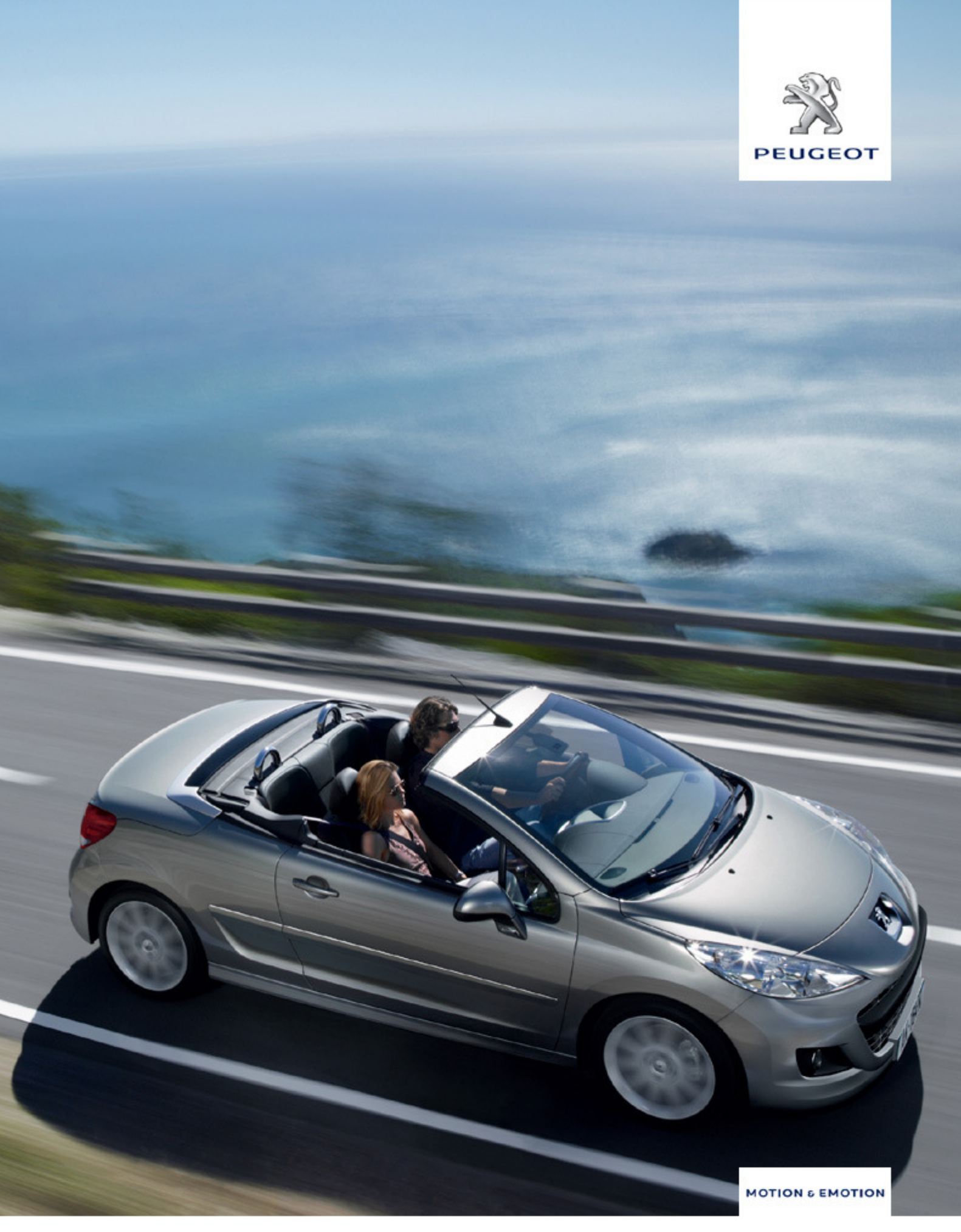
PEUGEOT 207 CC FEATURES AND SPECIFICATIONS